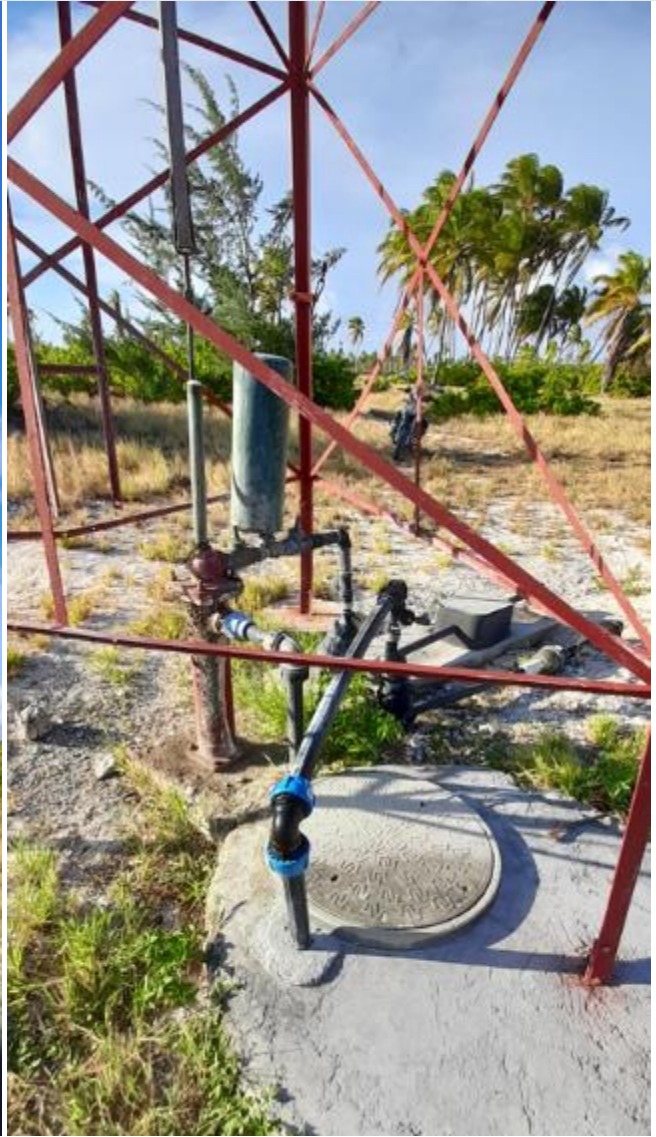
Figure 3. Four Wells gallery 3 West