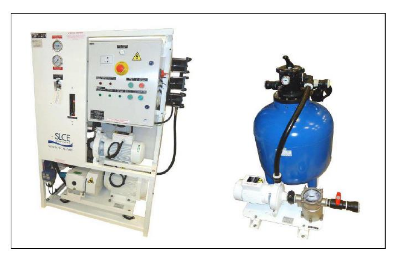
A typical 20,000L/day RO Plant

commissioning together with the provision of training in installation/operation/maintenance. The plant to be used by the Public Works Department in Funafuti to generate more clean drinking water in Funafuti, and, where necessary, to be deployed to outer islands during times of water shortages.