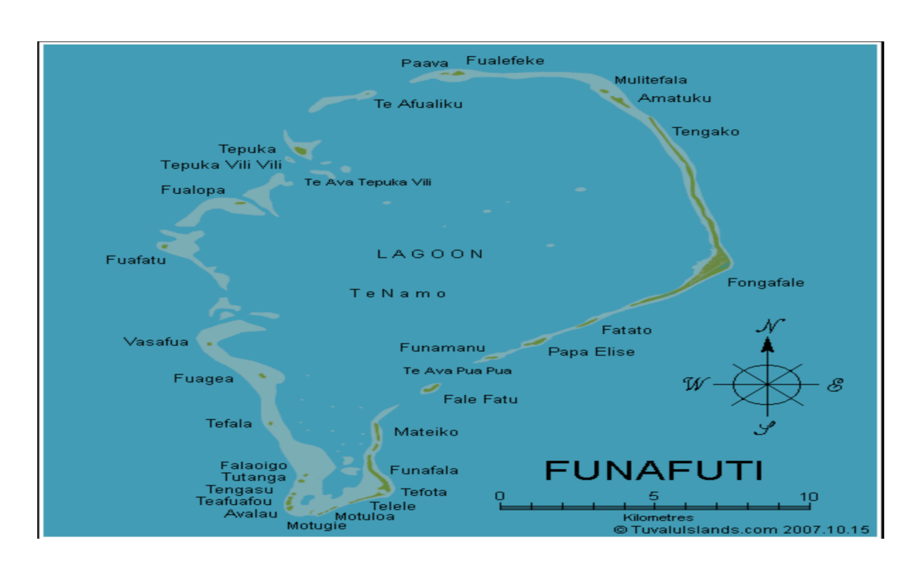
Map 2: Map of Funafuti