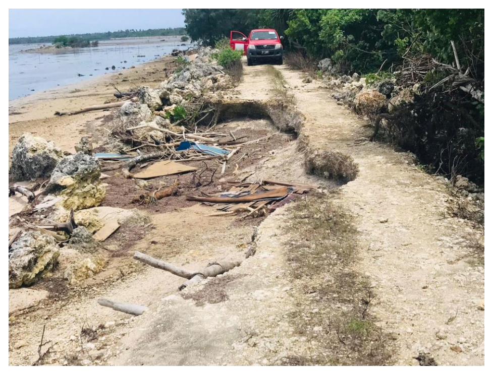
Figure 2-4. Damage revetment and coastal track

Repairs to non-return valves on culverts (x2) are also required. Based on observations in 2018 and recent discussions, this is mostly a matter of removing rock and debris that has accumulated against the one-way valves and prevented proper function. Therefore, it is likely that while the revetment is being repaired, these works could also be undertaken with little extra cost.