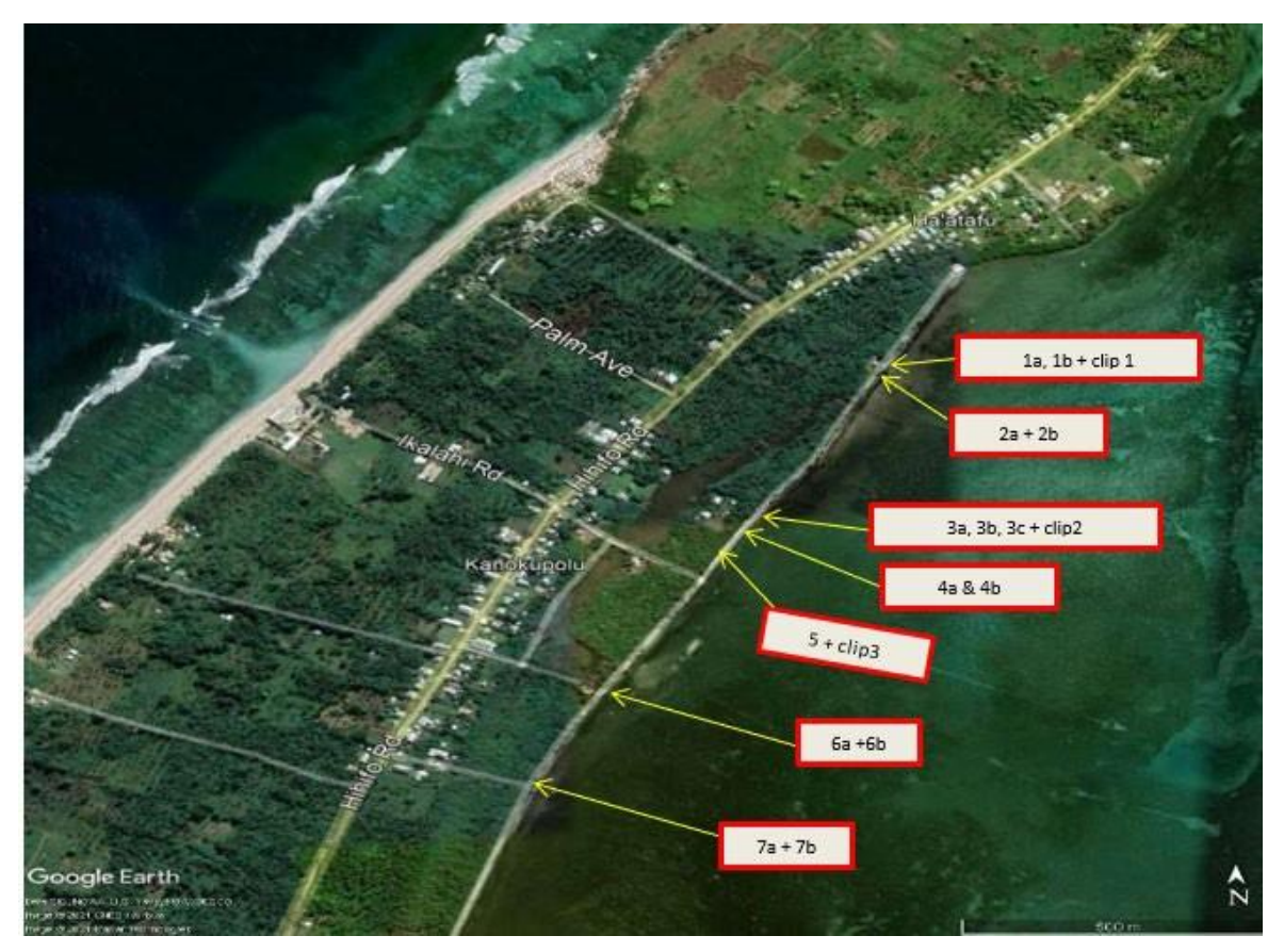
Figure 2-7. Sites of significant damage along the northern 1,350 m of the revetment (Attachment A).

The initial ground survey of the northern Kanokupolu revetment indicated that revetment crest height was as low as 1.2 m (MSL) in some areas, and mostly below 1.4 m along the damaged areas (Figure 2-5 and Figure 2-6). The northern 600 m length required repair works to lift the crest to 1.5-1.6 m, as well as focussed areas of rock placement where there is little to no rock protecting the road. The initial estimate of rock required for this area was 2 m<sup>3</sup>/linear metre of revetment along the length of revetment. Based on the results of the ground survey and the accompanying photographs, ~300 m<sup>3</sup> of rock to carry out the repairs and heightening of this section of the revetment was considered sufficient; most parts required <1 m<sup>3</sup> to heighten the revetment, while some areas just north of the drainage channel (Figure 2-5) require more rock. However, even where the damage was extensive (Figure 2-6), the original rock is still on site and only requires moving back onto the revetment.