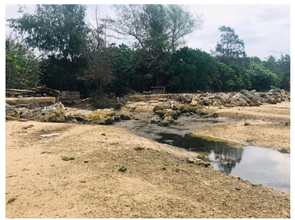
Figure 2-3. One of the blowouts through the coastal track and revetment