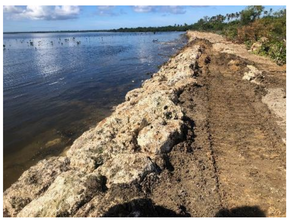
Figure 2-2. The revetment that extends from Ha'atafu to 'Ahau and encloses 2 distinct areas, Kanokupolu wetland in the north, and 'Ahau lagoon in the south. Originally built in the late 1960's, repairs and modifications were carried out in 2014 and 2018; but there are still several areas that require heightening and reinforcing, and the non-return valves along the Kanokupolu section require maintenance.