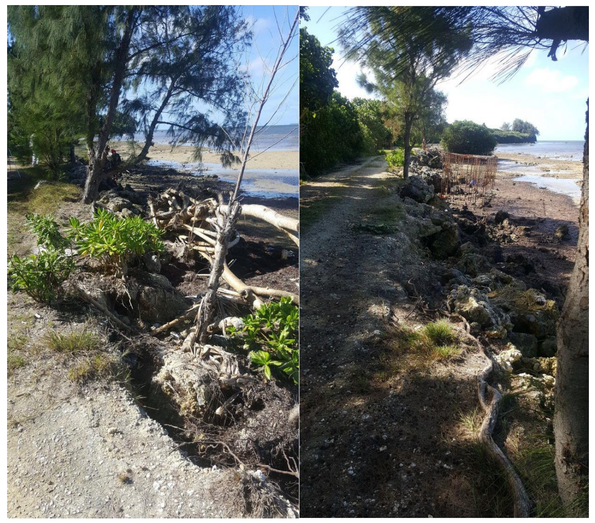
Figure 2-6. Damage to the northern part of the Kanokupolu revetment that occurred during TC Harold.