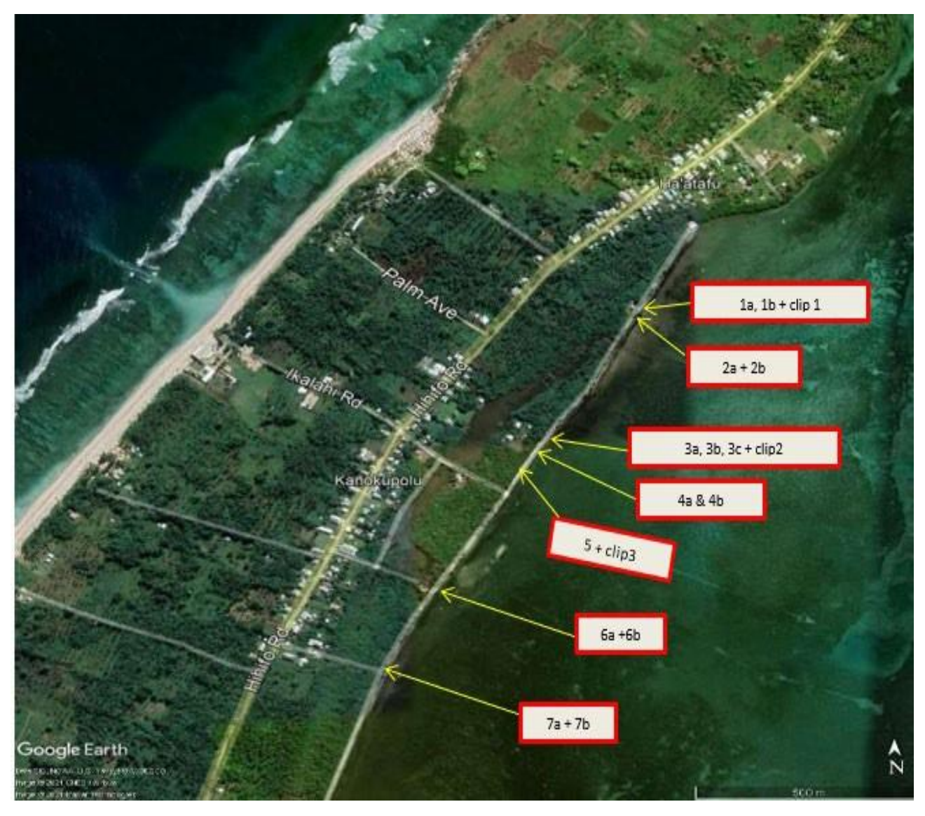
1.1.1. LOCATION MAP