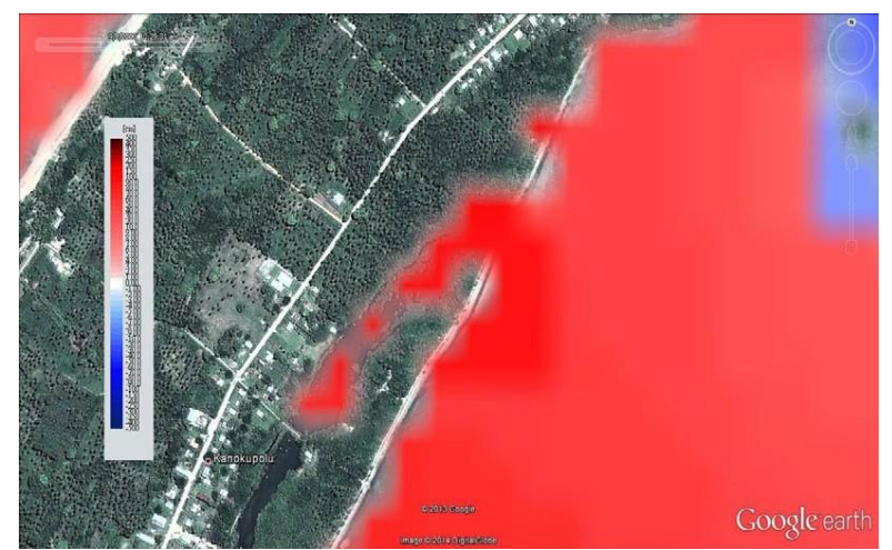
Figure 2-1. Close up of impact of a tsunami wave generated from an 8.7 magnitude earthquake at the Tonga Trench, showing two breaches of the coral foreshore (Geocare and Petroleum Consult, 2014).

The Kanokupolu revetment is approximately 2.0 km long and provides a first line of defence to this area, which is susceptible to inundation during extreme events, and like much of the north coast of Tongatapu, tsunami inundation. Modelling with the revetment in place indicated that over-topping would occur along northern parts of the revetment during tsunami (Figure 2-1), which was reported during TC Harold (Mead et al. , 2020a). The tsunami waves following the 15<sup>th</sup> of January volcanic eruption overtopped the existing revetment and dislodged the top layer of boulders in some places. There were also two places where blowouts occurred such that the coastal track was undermined (Figure 2-3 and Figure 2-4). Heightening and repair of parts of the northern revetment were recommended in 2014 and 2018 (Mead and Atkin, 2014; Mead, 2018) (Figure 2-2), however, the funds were applied on the southern part of the revetment and the works for the 'Ahau living wall.