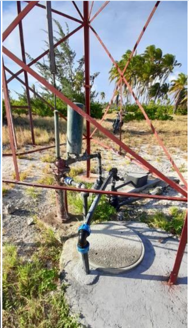
Figure 3. Four Wells gallery 3 West