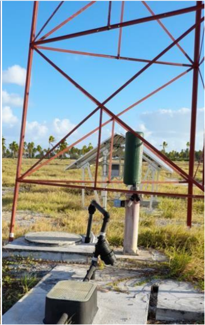
Figure 2. Decca gallery 2 East