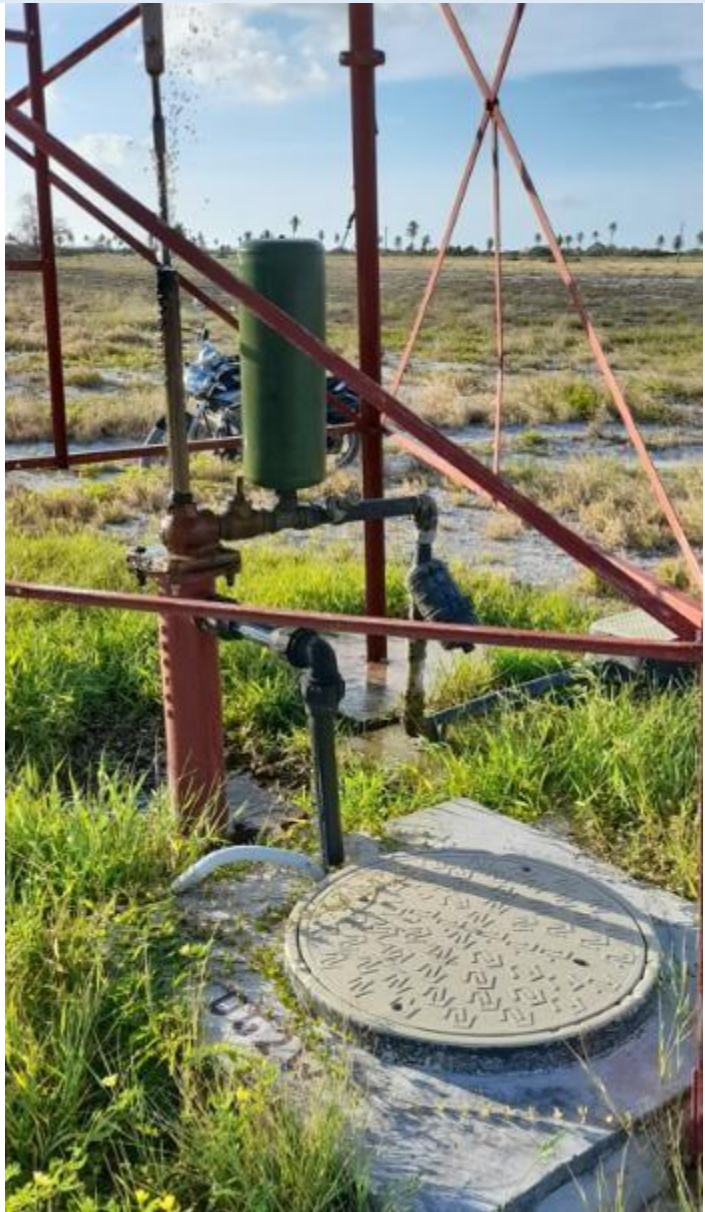
Figure 1. Decca gallery 2 West