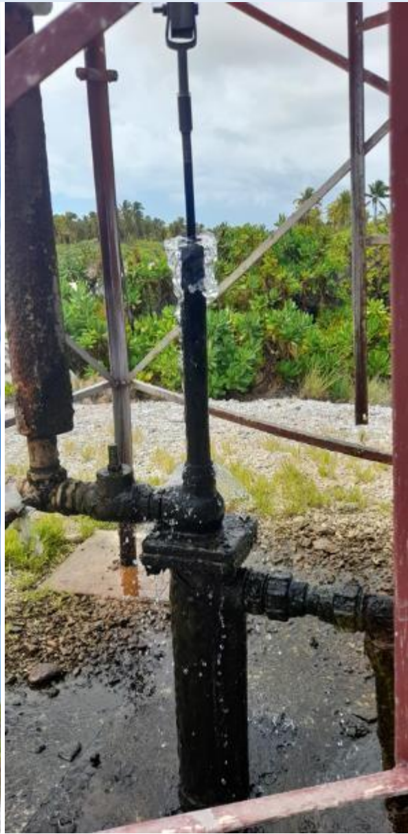
Figure 4. Banana gallery 1 West