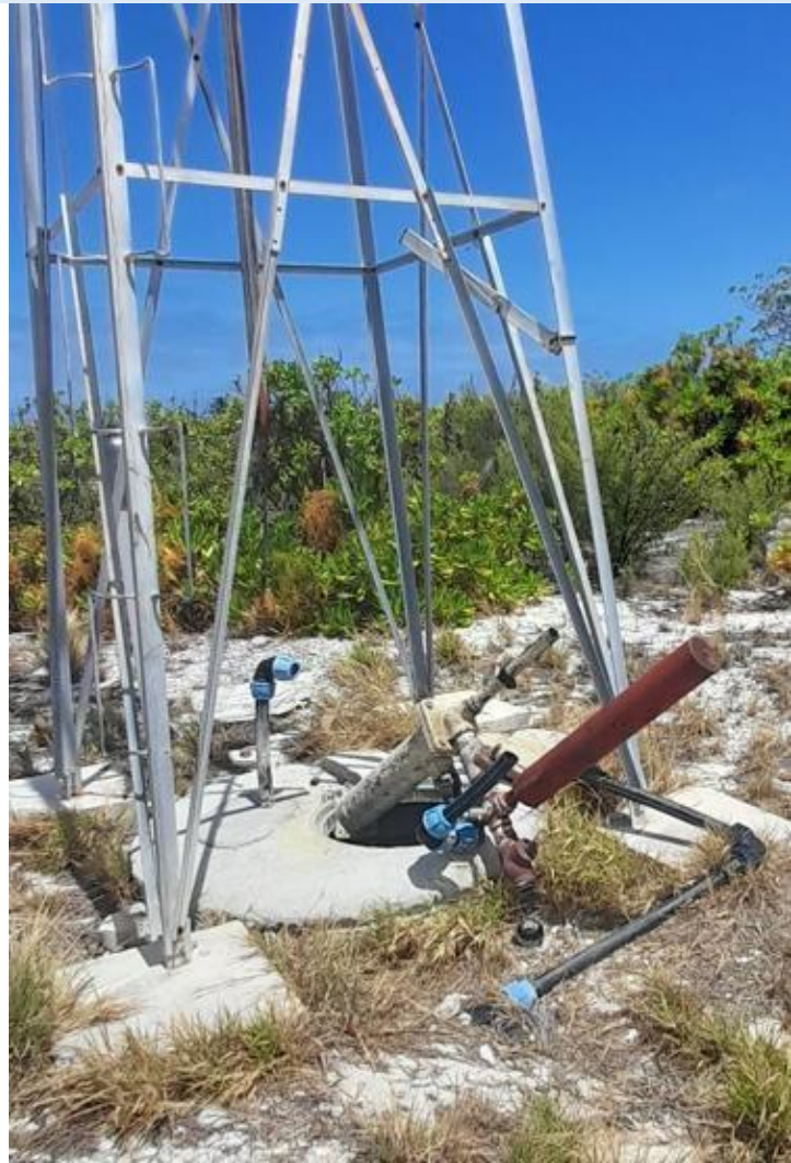
Figure 6. Banana gallery 3 West