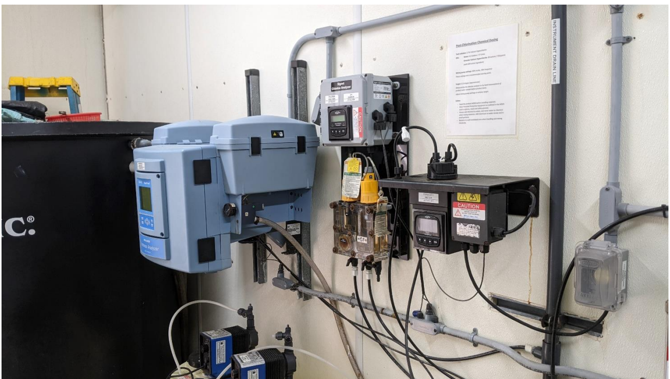
Figure 3. Treatment plant components