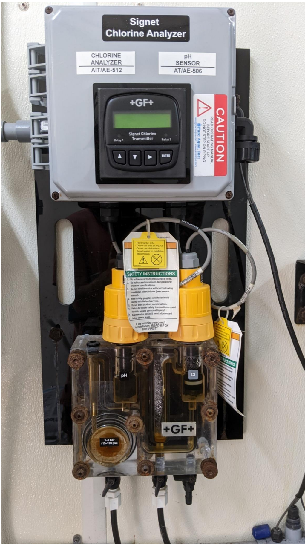
Figure 4. Faulty automatic chlorinator (GF Signet 4630 Chlorine Analyzer System)