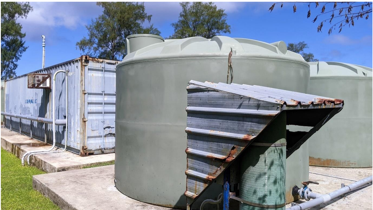
Figure 1. Container housing the Angaur treatment plant