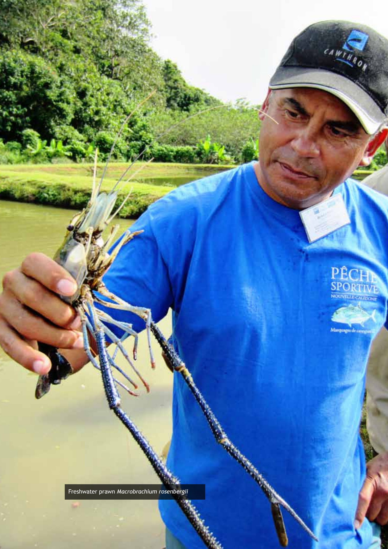
Freshwater prawn Macrobrachium rosenbergii