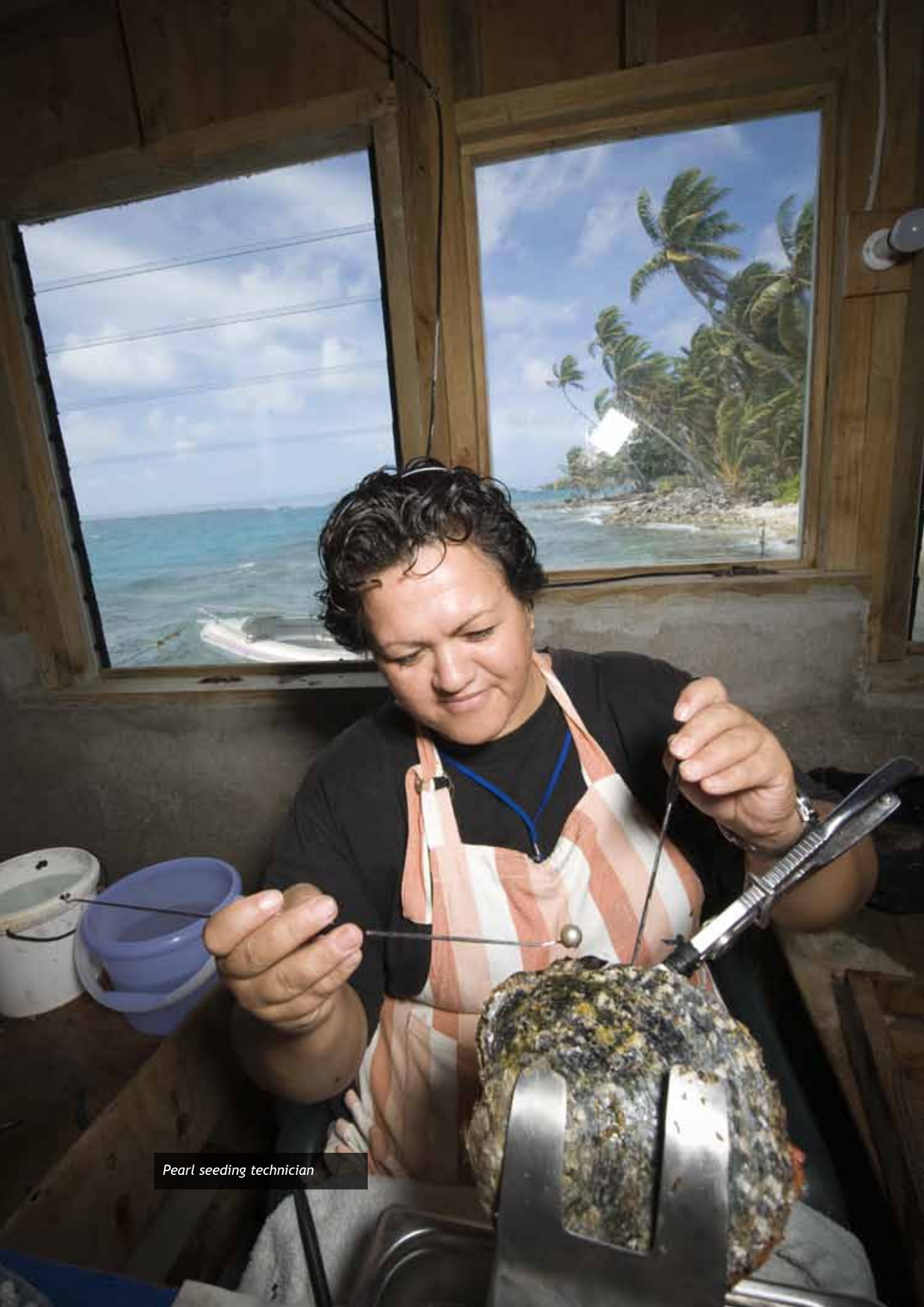
Pearl seeding technician