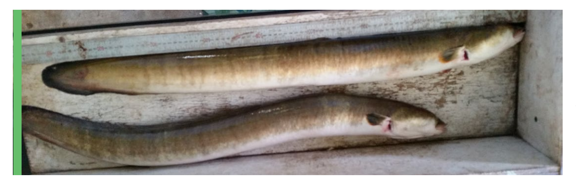
Two 100 cm, 500 g specimens of Pacific shortfin eel Anguilla obscura caught in Tailevu Province, Fiji Islands.