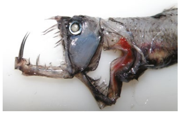
Some specimens require careful handling, such as this 20-cm long Chauliodus sp., which can tilt its head to allow the ingestion of large prey.