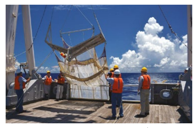
Trawl nets used to collect micronekton.