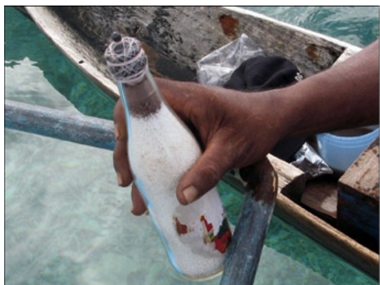
Figure 7. Typical “bomb” used in the region: It is made with a beer bottle filled with fertilizer and phosphorus scraped from matches.

that has been working on educational and conservation issues in the Banggai Archipelago (Lunn and Moreau 2004; Vagelli 2005b), and from the head of the Banggai Fisheries and Marine Affairs Department. In the end, CITES United States submitted the proposal to the CITES Secretariat.