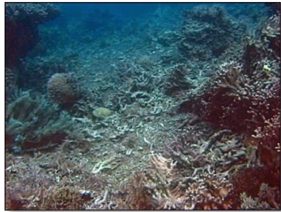
Figure 6. A recently bombed reef patch in Labobo Island. Dynamite fishing is widespread throughout the Banggai Archipelago and includes areas inhabited by P. kauderni.

The need for protecting this species became evident earlier in this decade as a result of the author's and other researchers' fieldwork (Allen