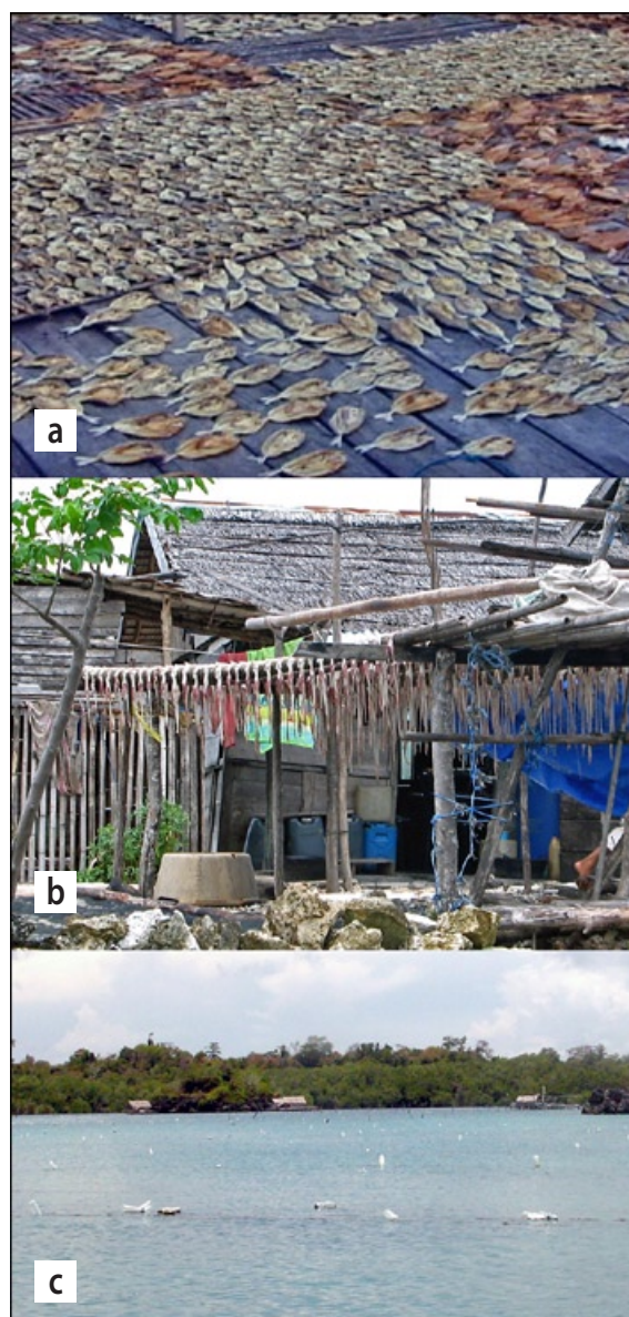
Figure 9. The economic activity due to the collection and trade of P. kauderni within the Banggai region is negligible. The overwhelming majority of people dedicated to sea-based activities focus their efforts on traditional fisheries, including production of salted-dried fish (a), squid (b), and seaweed culture (c).

reality is that the overwhelming majority (> 99%) of the approximately 160,000 local residents (Head of Regional Government, pers. comm. 2007) do not depend on P. kauderni for their livelihood. The vast majority of the Banggai people make their living with more profitable and traditional economic activities such as agriculture, seaweed culture, and fisheries (Fig. 9a,b,c). About 55% of the region's GDP is due to agricultural and traditional fisheries activities ( http://www.banggai-kepulauan.go.id 2008). The rest comes from mining, industry, public service, and trade activities.