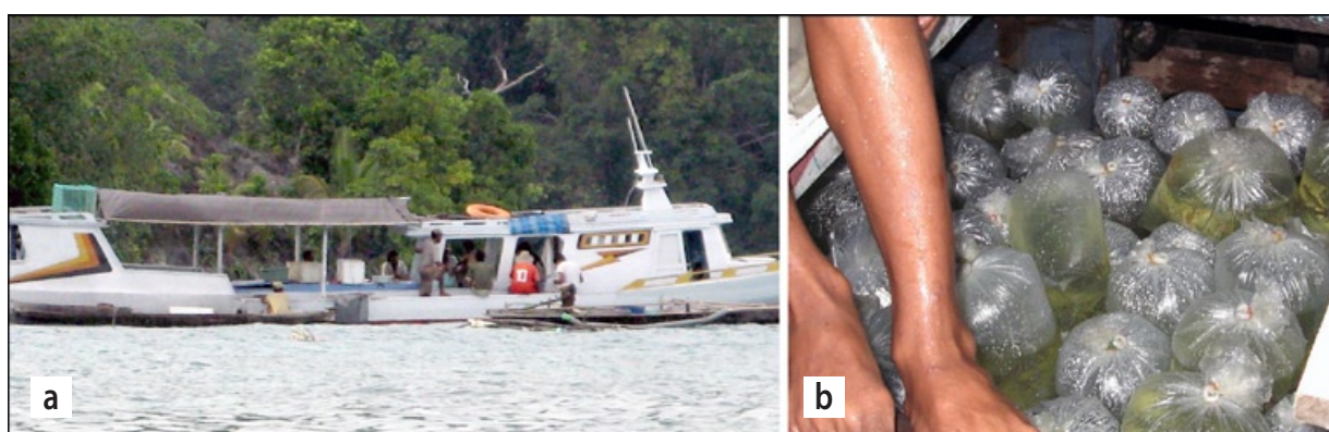
Figure 4. Local collectors at Bone Bone, Bangkuru Island, taking their catch to a buyer's boat (a), which can transport more than 12,000 specimens (b). Mortality during transport is usually about 25%, but can reach 50% or more (photos by A.A. Vagelli).