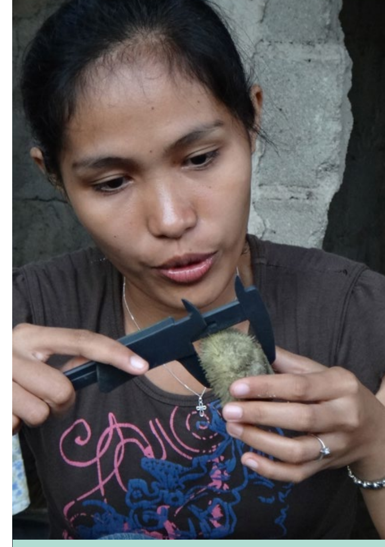
Measuring an urchin - ©Danika Kleiber

World Bank. 2012. Hidden harvest: The global contribution of capture fisheries. The World Bank: Washington, DC. 92 p. (Available at: http://documents.worldbank.org/curated/en/515701468152718292/pdf/664690ESW0P1210120HiddenHarvest-0web.pdf)