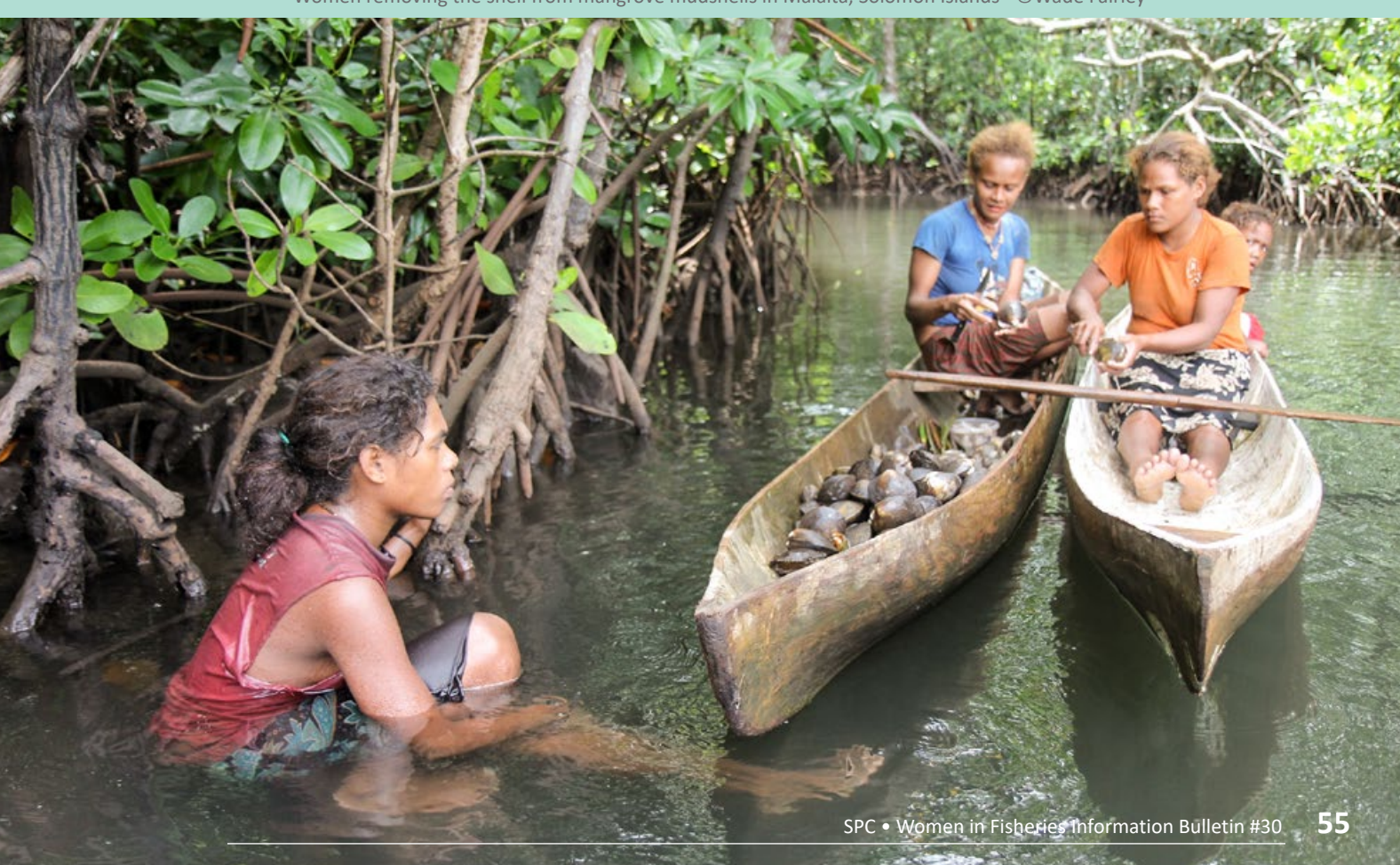
Women removing the shell from mangrove mudshells in Malaita, Solomon Islands