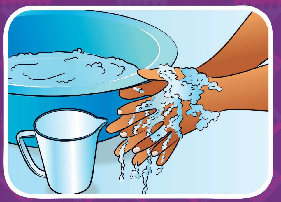
Wash your palms, between your fingers and backs of your hands