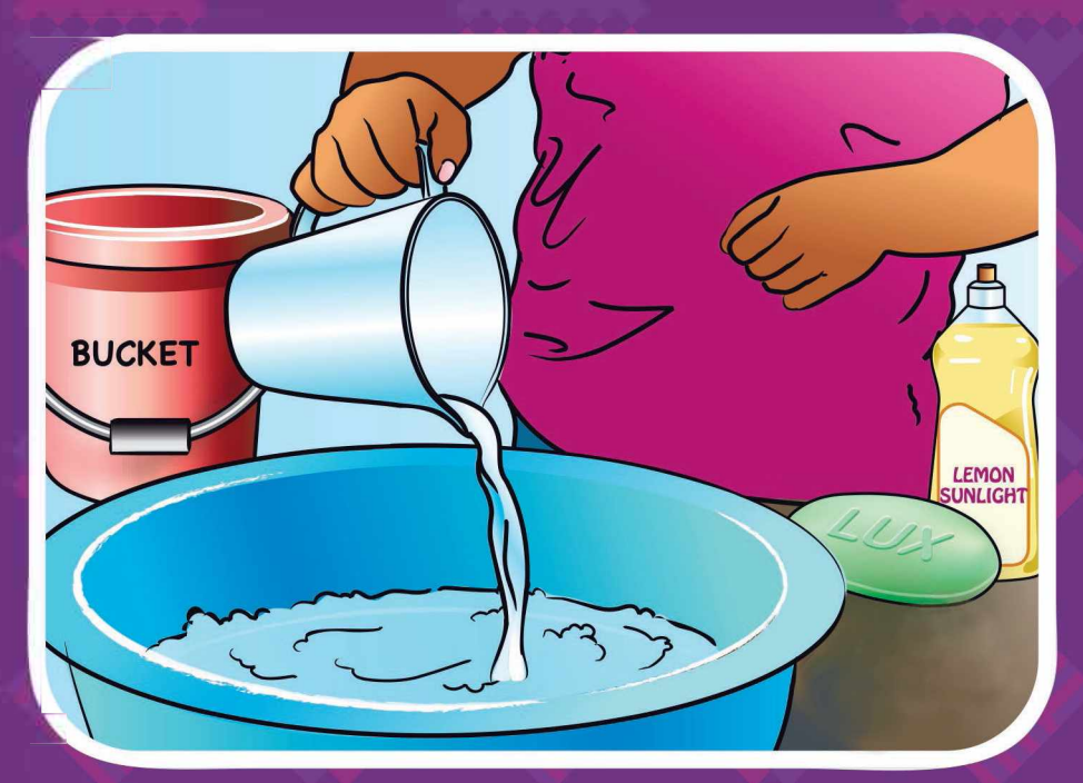
Wash your hands with soap and clean water