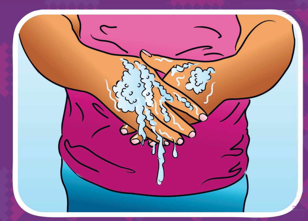
Rub your hands to make it soapy