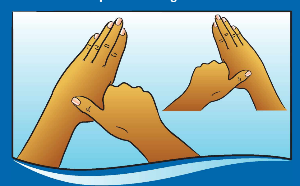
Rotational rubbing of left thumb clasped in right palm and vice versa