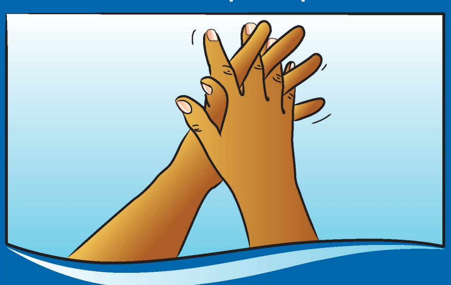
Palm to palm with fingers interlaced