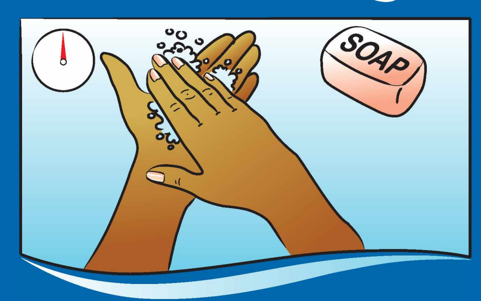
Lather hands with soap and water and rub hands palm to palm