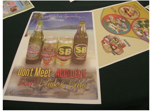
A poster from the Solomon Islands.

NCD problems in this region were complex, he said. 'They are a burden, they are enduring and they are the biggest threats to well-being in this region.'