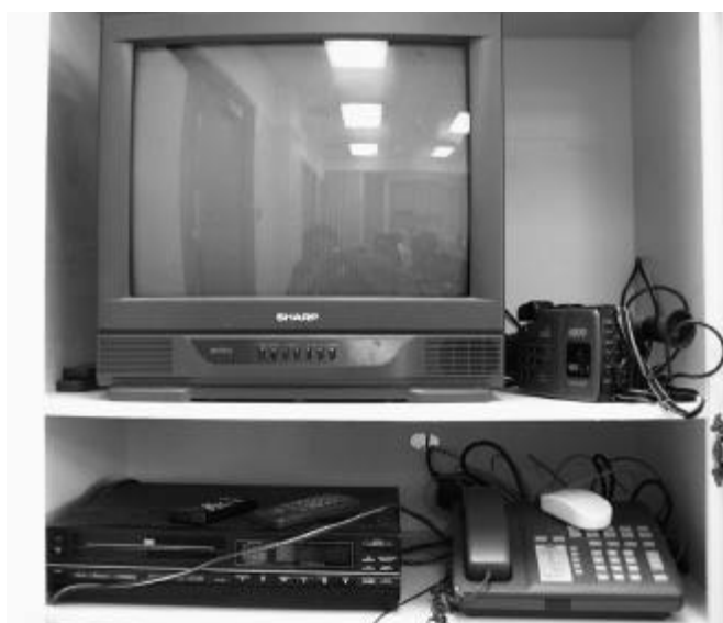
Fig. 2 and Fig. 3. The Picasso system

Figures for neighbour island nations taken from World Bank "Country at a Glance" sheets for 1988.