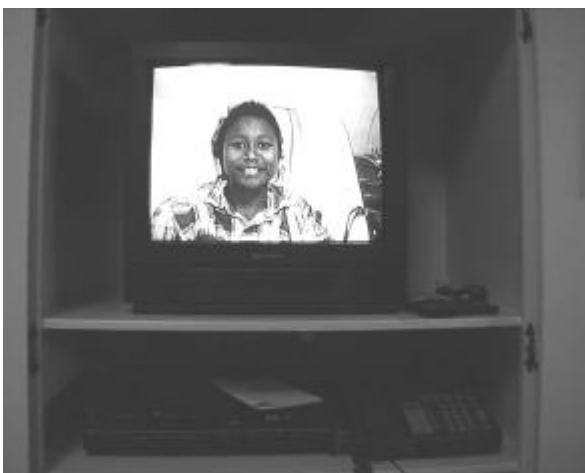
Fig 5. Patient Image