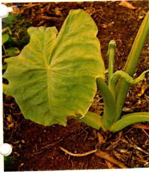
Left: Alomae symptom in the "male" taro caused by infection with small and large bacilliform virus.