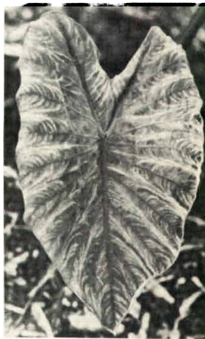
Fig. 2: Veinal chlorosis caused by infection of young plant with small bacilliform virus.

Although plants infected with either large or small particles recover to produce symptomless leaves, the viruses