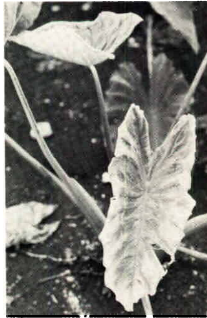
Fig. 3: Severe chlorosis and leaf deformation in mature plant caused by infection with small bacilliform virus.

For both bobone and alomae, removing (roguing) infected plants can give good control provided it is done as soon as symptoms appear. Plants should be pulled out and destroyed, preferably burnt or deeply buried. They should never be left in the garden, otherwise the planthoppers will migrate from them to healthy plants and spread the disease. Roguing is especially important during the first two months after planting when