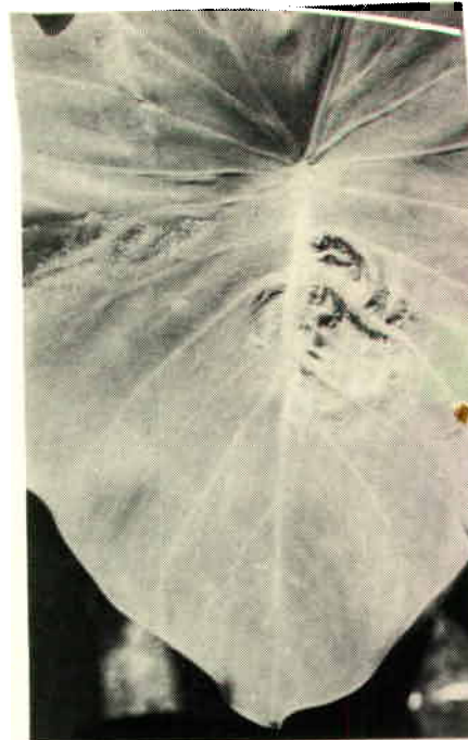
Fig. 1: Symptom caused by infection with the large bacilliform virus in the "male" taro.

The petiole of the first affected leaf is shorter than normal with irregularly shaped outgrowth (enations or galls) especially at the base. The leaf-blade hangs downward, is thick, extremely puckered and the veins are enlarged; these too have enations. The next leaves to appear are more grossly deformed: petioles are very short (20-30 cm) and the distorted leaf-blades remain rolled and twisted. Leaves are brittle. Usually 4-7 leaves are affected before gradual recovery occurs begin-