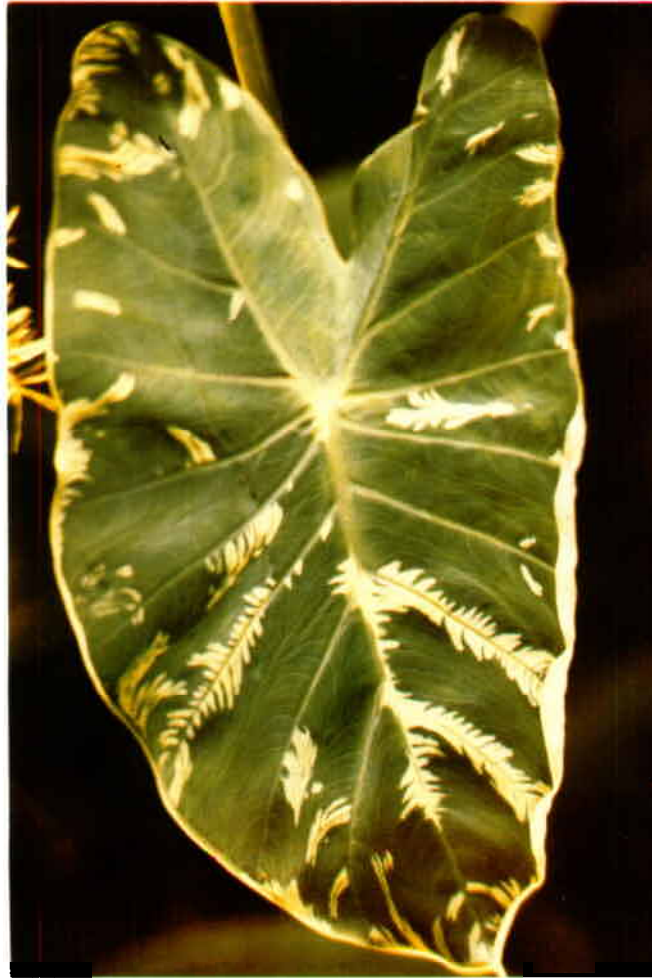
Taro leaf with feathery symptoms caused by dasheen mosaic virus.