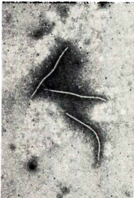
FIG. 1: Filamentous particles of DMV. Each strand is about 7500 Angstroms long. (An Angstrom unit is a hundred-millionth of a centimetre.)

DMV does not cause a lethal disease; its chief effect is to retard plant