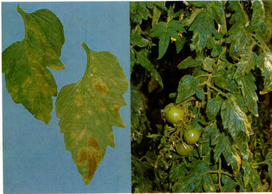
Symptoms of tomato leaf mould caused by the fungus Fulvia fulva .