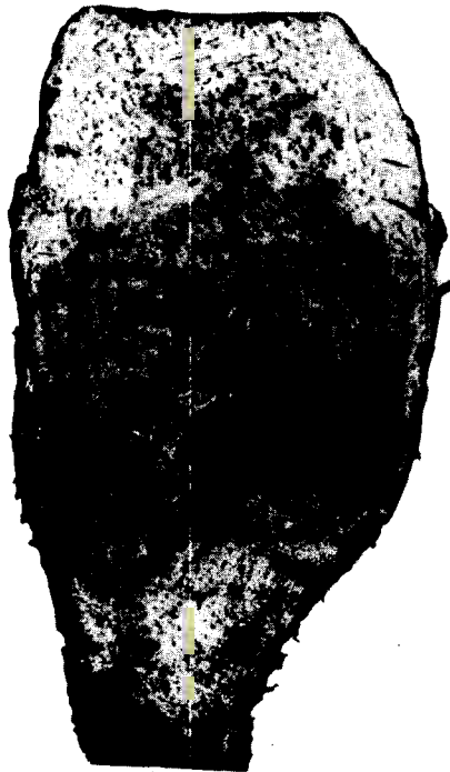
Fig. 2: Post-harvest corm decay by P. splendens . A white, dry rot at the base with a discoloured area above the rot margin. After storage for 4 days.

Control of post-harvest rots can be achieved by placing corms in polythene bags after they have been cleaned of soil and main leaves and suckers have been removed. Excellent control has also been achieved in tests in Cook Islands when taro for export to New Zealand were dipped in a mixture of benomyl (Benlate, 2 g/l) and Ridomil (1 g/l) and packed in plastic-lined cardboard boxes. □