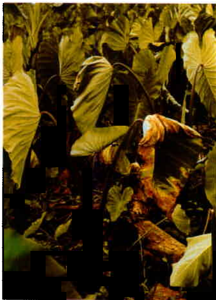
Left: Wilted plant affected by root rot disease.