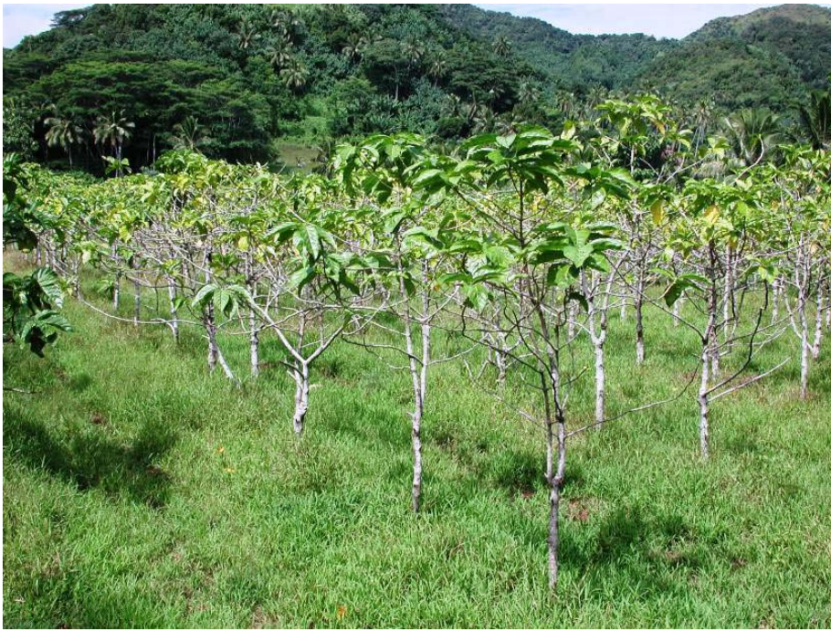
Figure 2: Noni ( Morinda citrifolia ) heavily infested with root-knot nematode.

to the nematode galls instead of the leaves and fruits. Root-knot infections encourage fungal and bacterial diseases. Crop yields are reduced, and harvested produce is of poor quality.