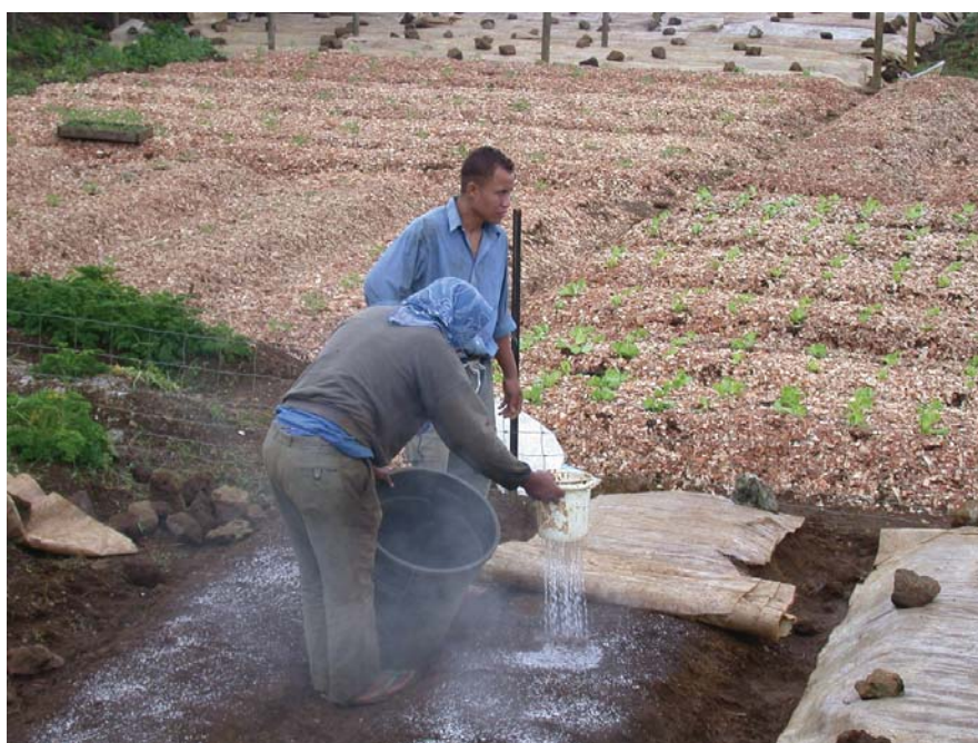
Figure 4. Hot-water treatment of seedbeds.

Crop rotation is one of the most effective ways of managing nematodes. To be most effective, non-host crops, poor hosts or those with resistance or tolerance to root-knot nematodes should alternate with a susceptible crop. A possible crop rotation would be: susceptible > poor host > poor host > non-host or resistant host > susceptible.