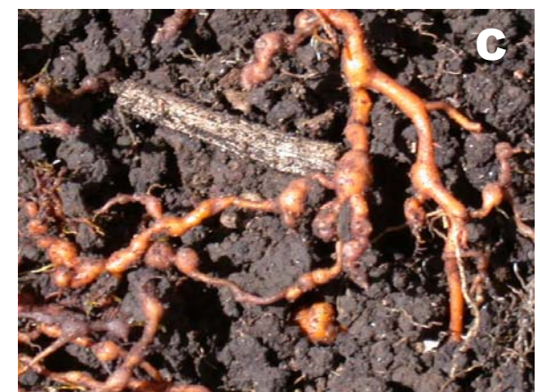
Figure 1: Root-knot nematode infections of A) pawpaw, B) parsley and C) noni.