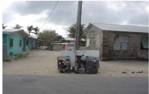
IWP Jenrok Recycling Station