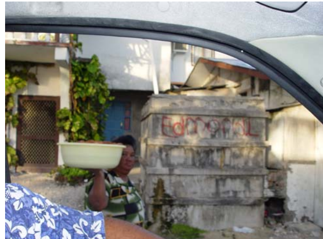
Women going house to house selling Donuts

84% of the households surveyed received their cash from salaries & wages earned in the workplace. 3% of the households get their cash from pension benefits. Another 3% get their income from lease payments. The balance is self-employed income, mainly in handicraft and homemaking activities.