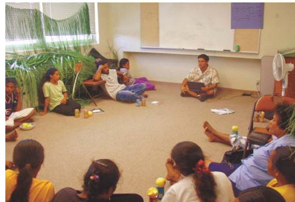
Youth Focus Group