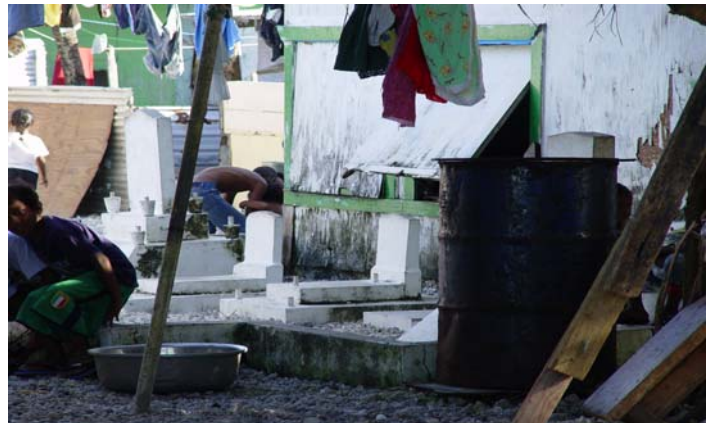
4 graves next to house (notice the two baby graves)