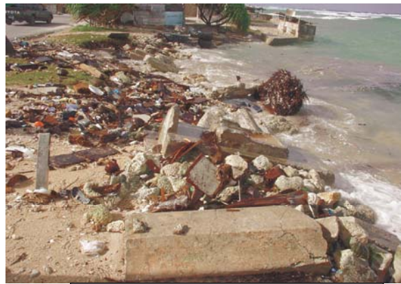
Damaged graves due to erosion