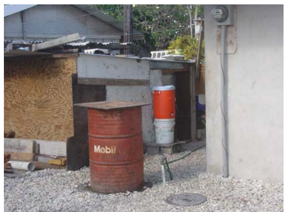
55-gallon fuel drum used as a water tank

MWSC reported there were 211 water-metered customers in Jenrok, but 102 customers were recently disconnected due to non-payment. Of the 109 remaining customers, two-thirds are 60 days behind in paying the bills. Only about half of the households in Jenrok have access to city water.