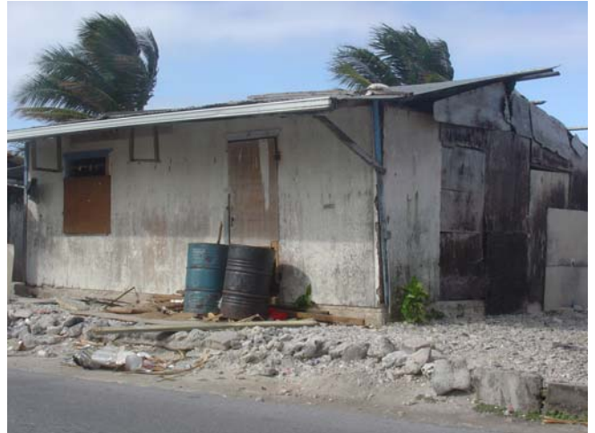
Typical House in Jenrok

Most of the water tanks in Jenrok are plastic or fiberglass built and the average tank size 750 gallon. However, many households use steel 55-gallon fuel drums to store water. Many use well water to wash and bath and about 10% use their own well water for drinking 11 .