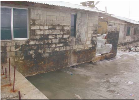
Incoming waves under house (bathroom already collapsed)