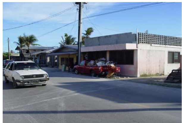
Truck used as a trash bin

problem in Jenrok. There is a prevailing feeling among the community that the municipal government is responsible for managing the waste problem in Jenrok, especially since many are already pay taxes for solid waste management services.