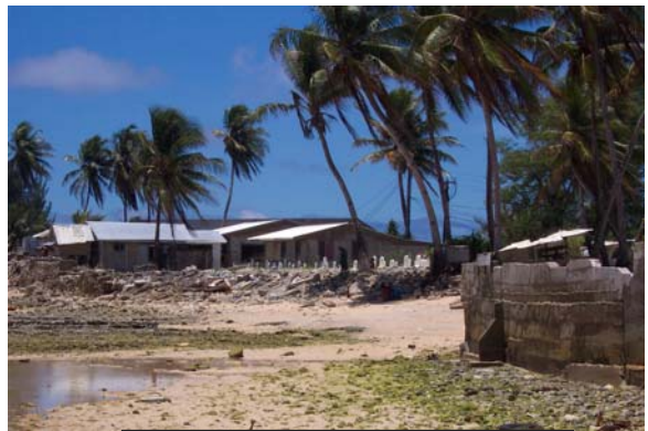
Cemetery at low tide