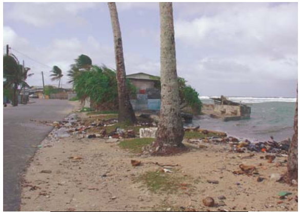
Trash washed up on road