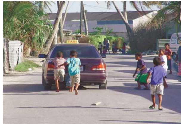
Kid playing in Street and jumping on Taxis

The group also believes government does not pay enough attention to youth issues in the Marshall Islands. The group believes the way to combat the problem is to build sporting facilities and supporting NGO's programs in Jenrok. Creating youth activities will help keep youths from engaging in risky activities.