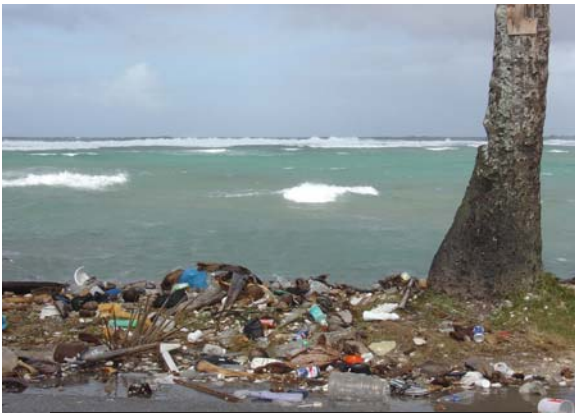
Trash washed up by high wave action