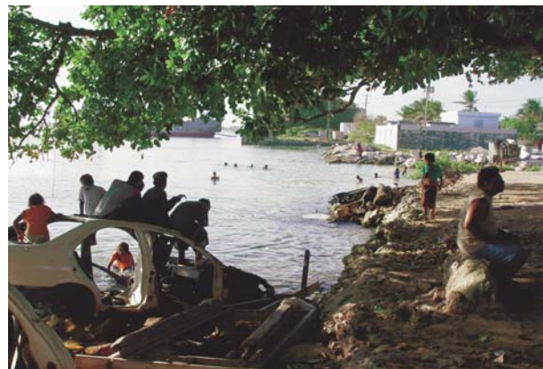
Kids cooling off in lagoon in the afternoon