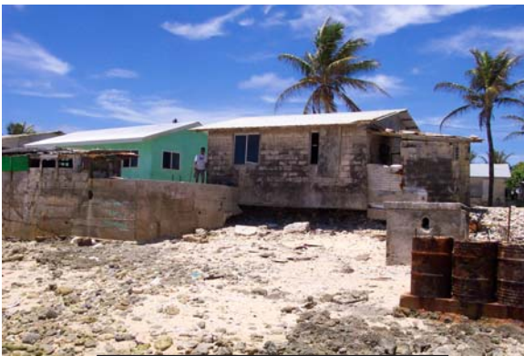
House at low tide