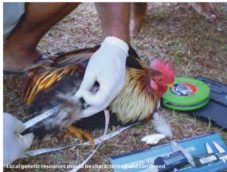
Local genetic resources should be characterized and conserved

World Bank. 2009. Minding the stock: Bringing public policy to bear on livestock sector development. Report No. 44010-GLB. Washington, DC: The International Bank for Reconstruction and Development/The World Bank.