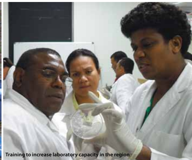
Training to increase laboratory capacity in the region