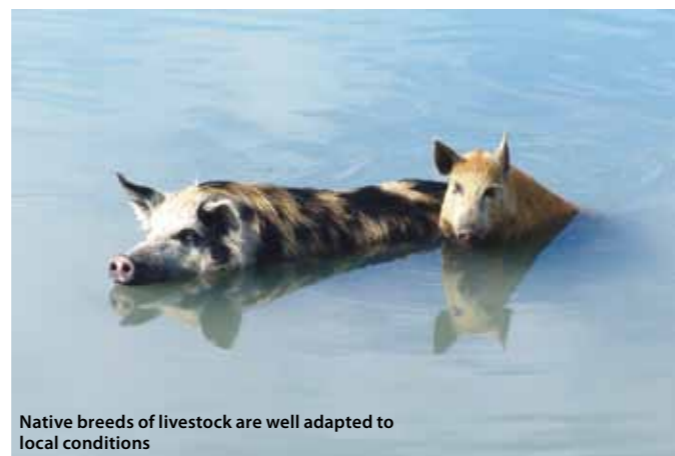
Native breeds of livestock are well adapted to local conditions