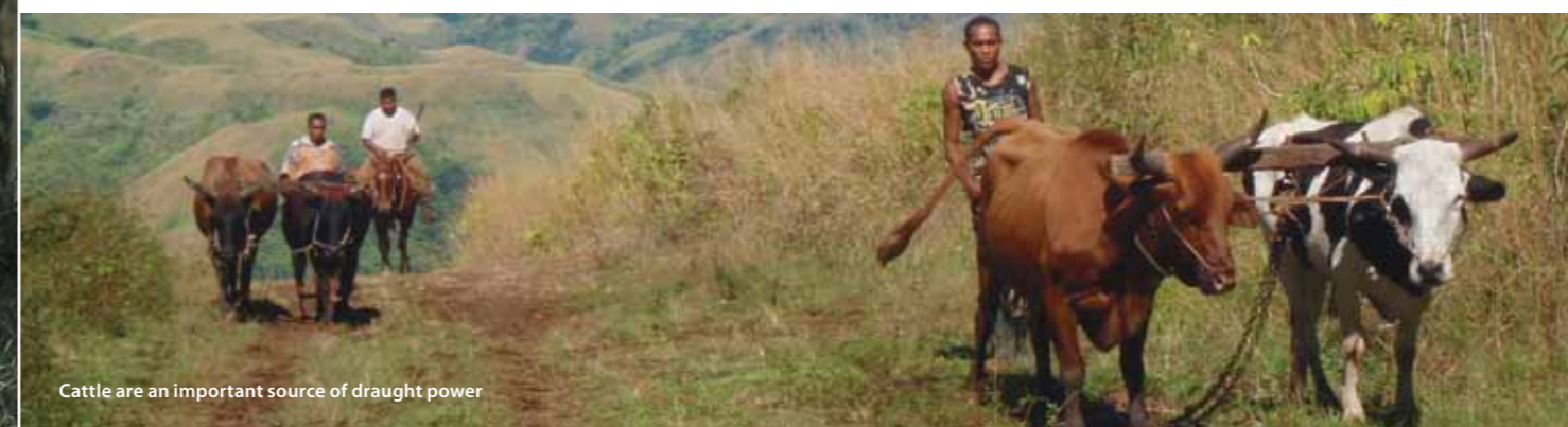
Cattle are an important source of draught power