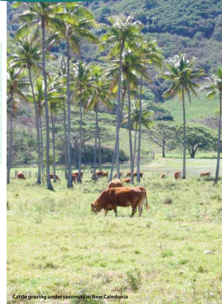
Cattle grazing under coconuts in New Caledonia