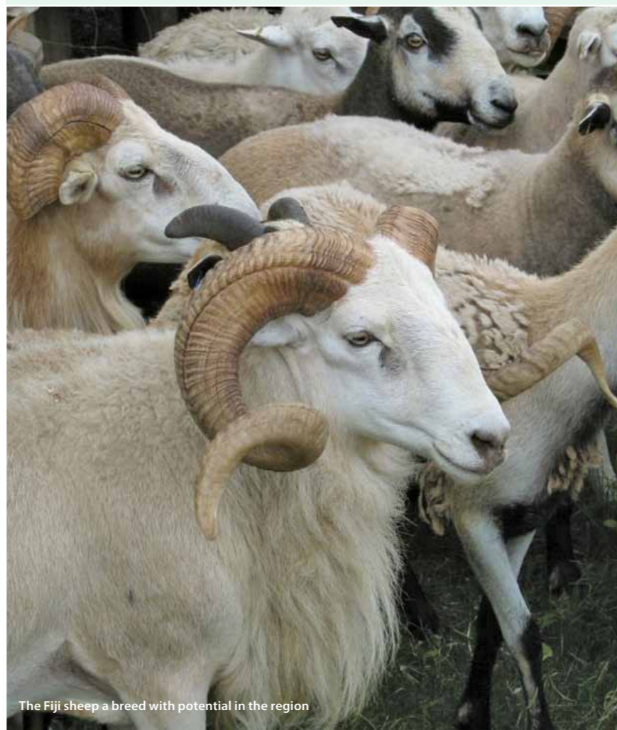
The Fiji sheep a breed with potential in the region