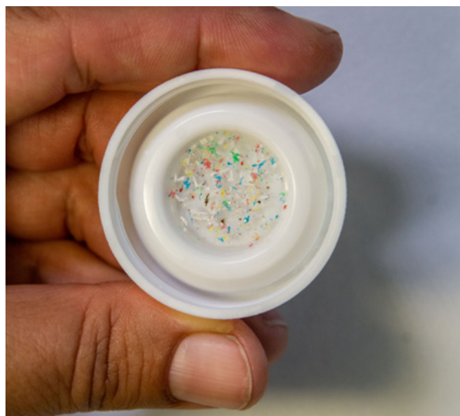
Secondary microplastics derived from large plastic items break-down.

At a technical level, increased sampling for plastic ingestion in marine biota and humans could assist in identifying linkages between microplastics and long-term, population-level impacts, impacts on the food web, and socioeconomic impacts on Pacific Island communities. Further research is critical, given the evidence that suggests microplastics will persist in the marine environment far into the future.