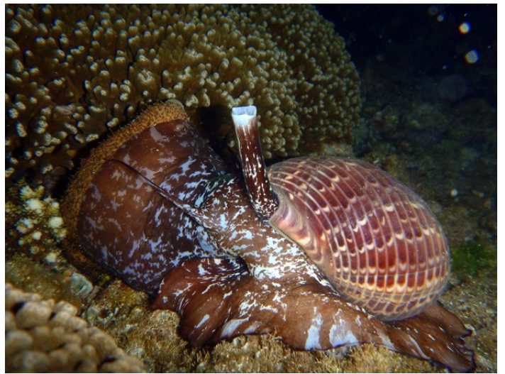
Figure 2. Tonna perdix attempting to suck the holothurian Actinopyga echinites into its proboscis by grasping its sides.