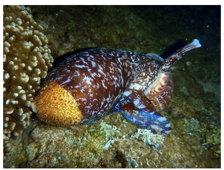
Figure 4. The gastropod's last attempt results in the absorption of the whole of the holothurian's body, in progress here. The predator remains motionless at the end of the operation.