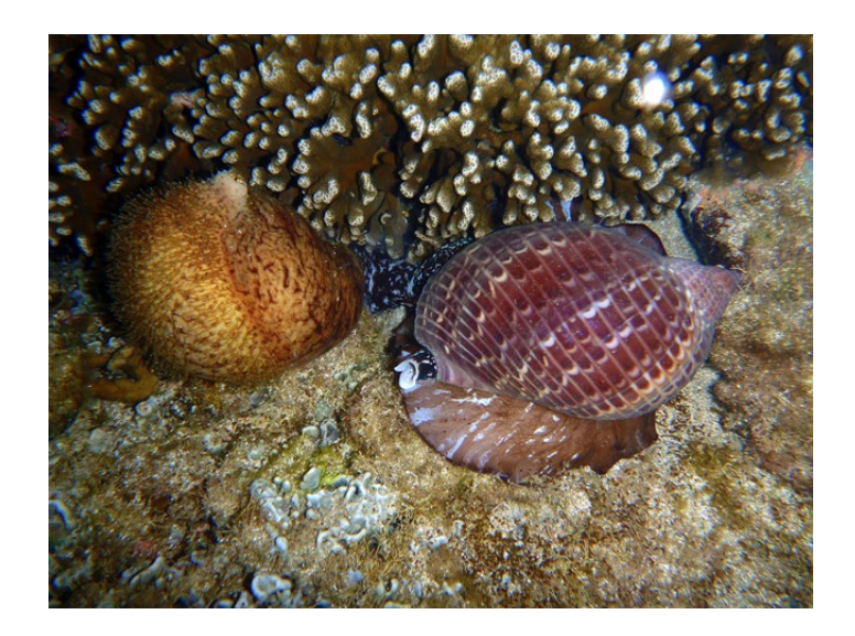
Figure 1. The holothurian Actinopyga echinites after contact with the predator Tonna perdix . Note the holothurian has swollen itself up with water (defence mechanism #3).