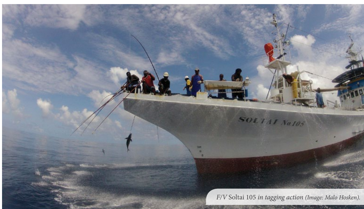
F/V Soltai 105 in tagging action (Image: Malo Hosken).