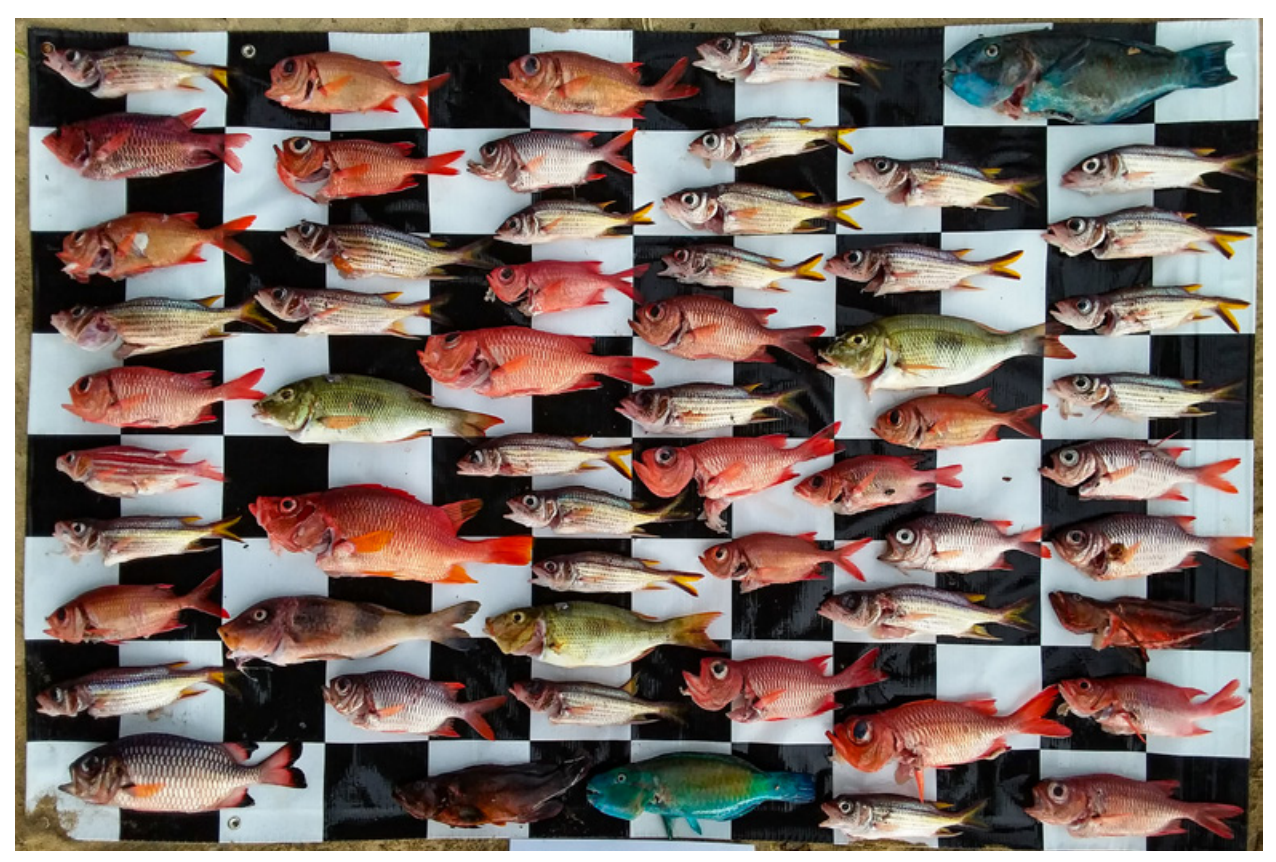
Figure 2. A catch from the southeast Malekula site, comprising nine species from five families, including five species of soldierfish/ squirrelfish (Holocentridae), one species of emperors (Lethrinidae), one of goatfish (Mullidae), one of parrotfish (Scaridae), and one of groupers (Serranidae).