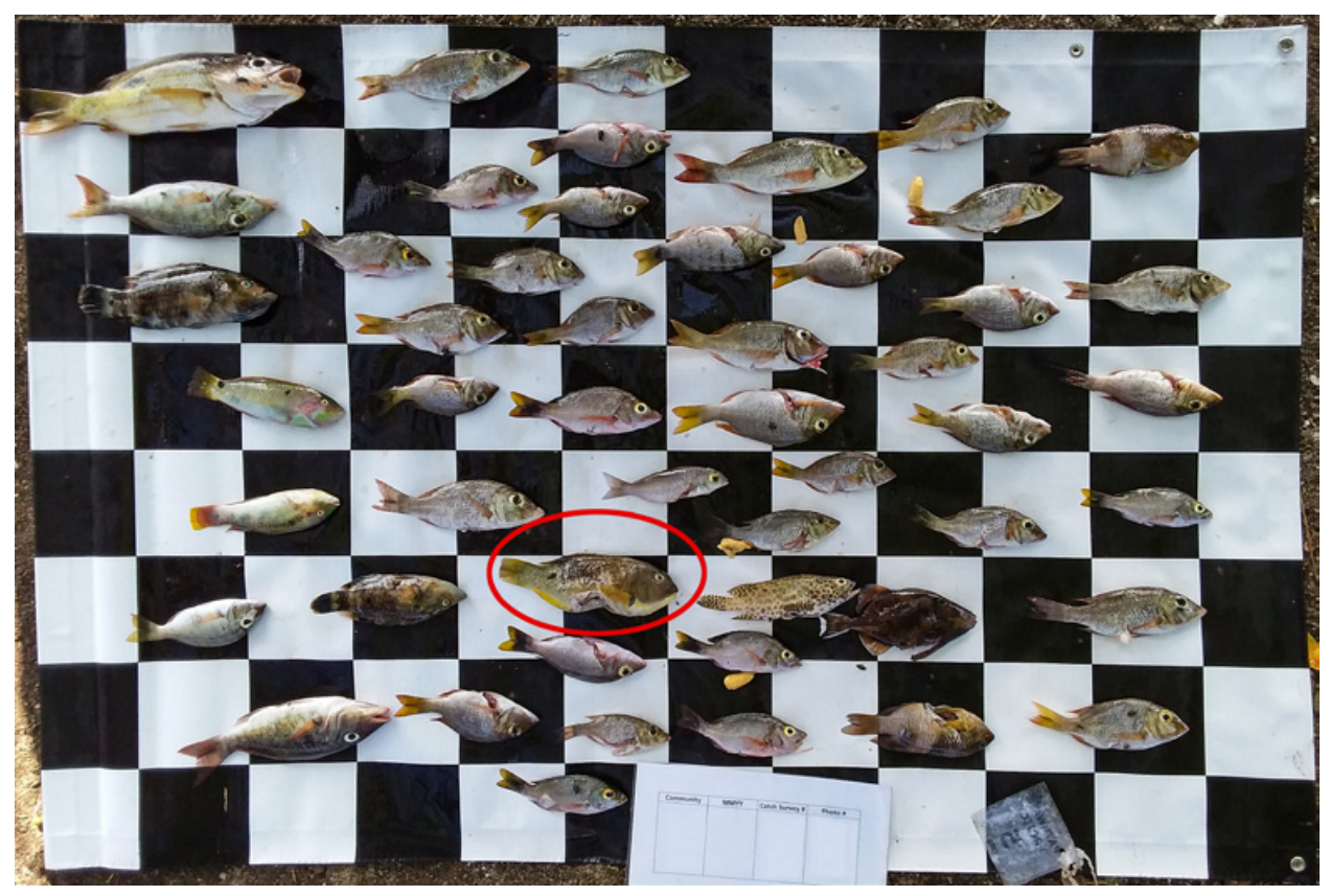
Figure 5. The only tuskfish ( Choerodon sp.) reported among fish caught at the southeast Malekula site in round one of data collection (n = 1946). Fishers suggested that this fish's reappearance after 10 years of absence, could be a result of the tabu area established three years prior.