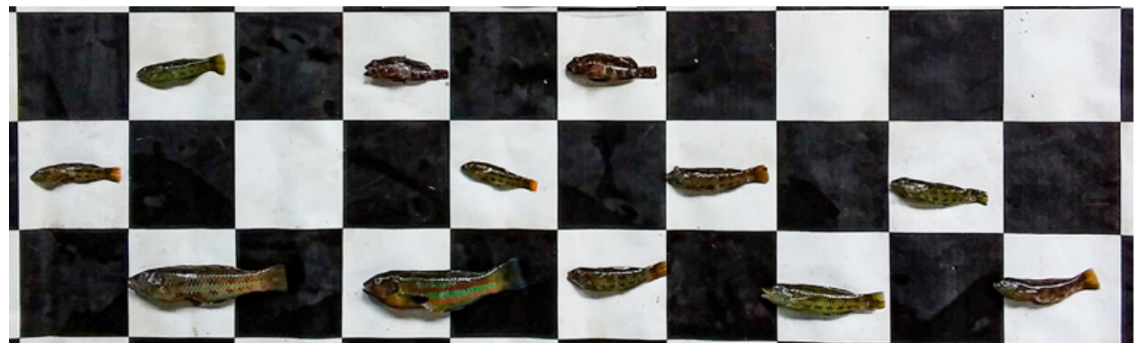
Figure 3. A catch from the Tanna site, where fishing predominantly supplies subsistence demand. Note that fish are small (grid squares measure 10 cm x 10 cm) and only four species from two fish families were present, including one species of hawkfish (Cirrhitidae) and three of wrasses (Labridae).