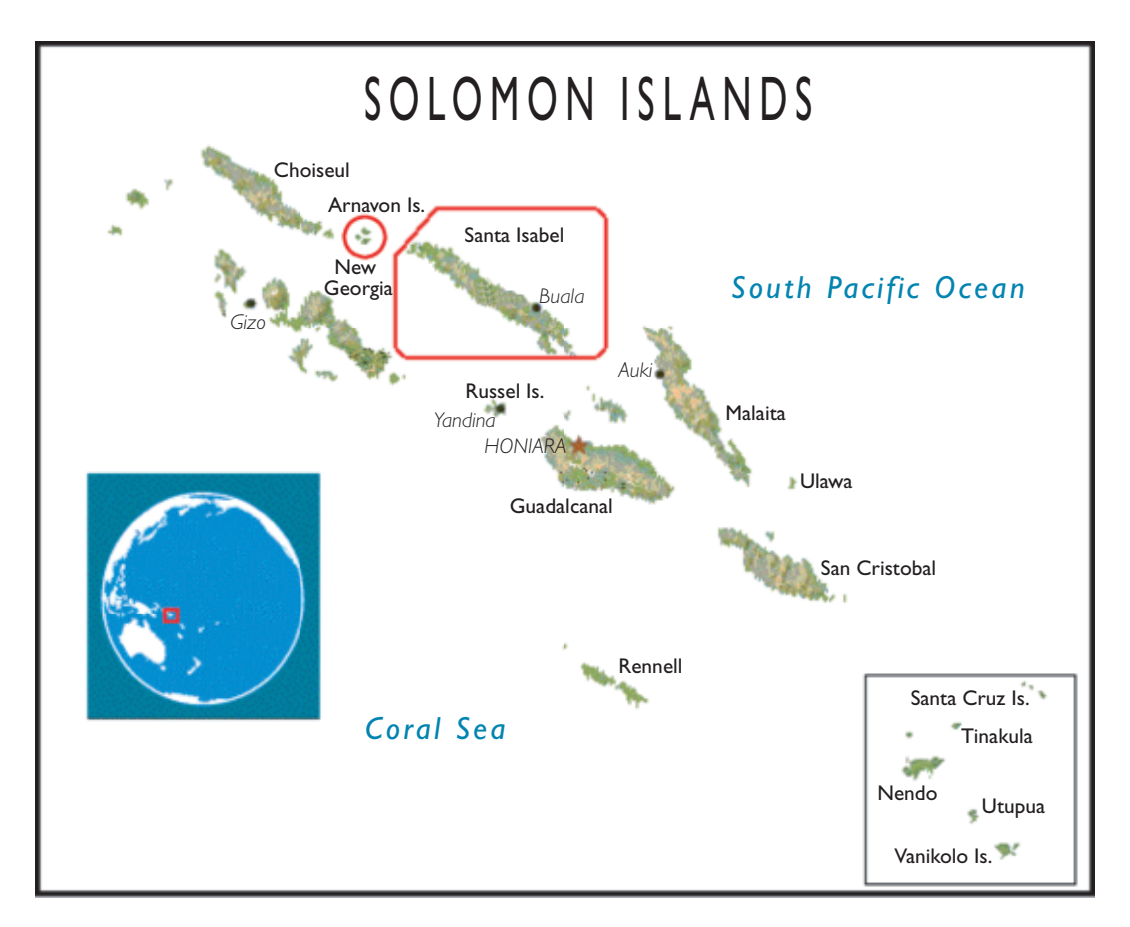
Figure 1. Solomon Islands, with research sites highlighted

Pacific. It is the third largest archipelago in the South Pacific. Land accounts for only 27,556 km<sup>2</sup> of the Solomon Island's total area of 1.35 million km<sup>2</sup>. There are nine provinces comprising 992 islands, only 347 of which are populated. Coral reefs and lagoons surround most islands, and tropical rainforest covers approximately 79 per cent of the country (Honan and Harcombe 1997: 21). The field site comprised the Arnavon Islands (AMCA) and the Santa Isabel communities of Poro, Guguha, Kia and Allardyce.