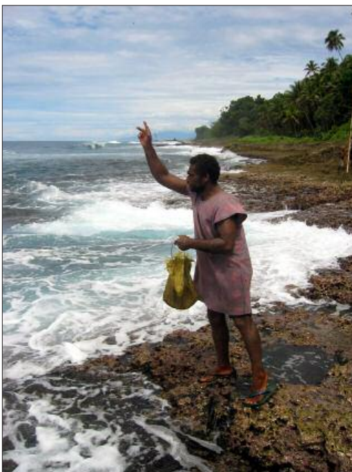
Figure 6. Throwing kochi into the sea to attract drummerfish.