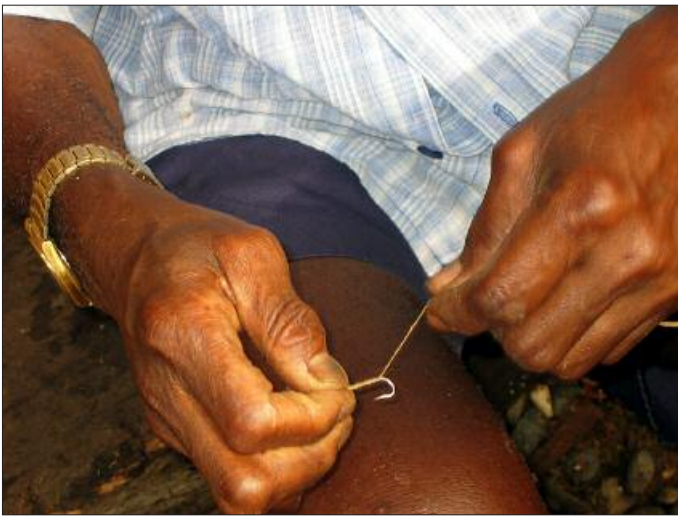
Figure 5. Wrapping the laobaulu around a fishing hook.

The bulukochi fishing method described in this paper is a highly skilled and sacred fishing method that is an important component of Solomon Island cultural heritage. The chants, local knowledge and skill required to capture the highly esteemed drummers were held by a select few and these individuals gained special respect and recognition in their community. With this mana also came social responsibilities and obligations, with highly skilled bulukochi fishermen often being called on to capture drummerfish for individuals and families both within and outside of their communities.