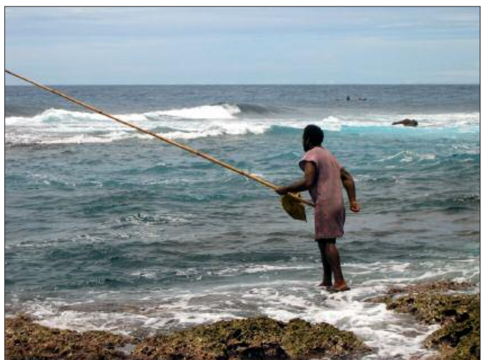
Figure 7. A fisherman about to throw the baited hook and line into the sea.