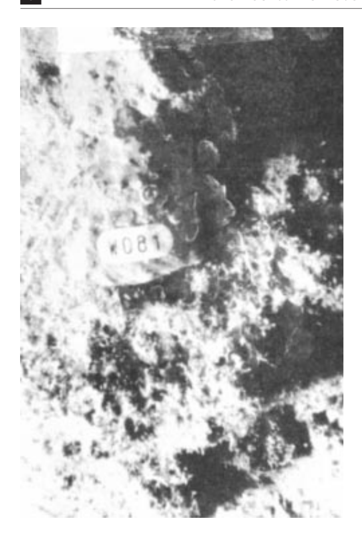
A tagged juvenile trochus, about 20 mm diameter (estimated), newly released on the reef. The dark spot on the tip of the shell is a blob of pink-coloured cyanoacrylate glue, used to help find the tiny shell after release.

participants were seasick and unable to function on the trip down, but by the end of the week some were sufficiently adapted to carry out data analysis and write-up of results on the return leg. After arrival at Aneityum, the Coriolis anchored in a sheltered location, and survey work was carried out using the vessel's two outboard-powered dive tenders.