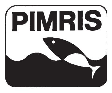
Pacific Islands Marine Resources Information System

PIMRIS is a joint project of 4 international organisations concerned with fisheries and marine resource development in the Pacific Islands region. The project is executed by the South Pacific Commission (SPC), the South Pacific Forum Fisheries Agency (FFA), the University of the South Pacific's Pacific Information Centre (USP-PIC), and the South Pacific Applied Geoscience Commission (SOPAC). Funding is provided by the International Centre for Ocean Development (ICOD) and the Government of France. This bulletin is produced by SPC as part of its