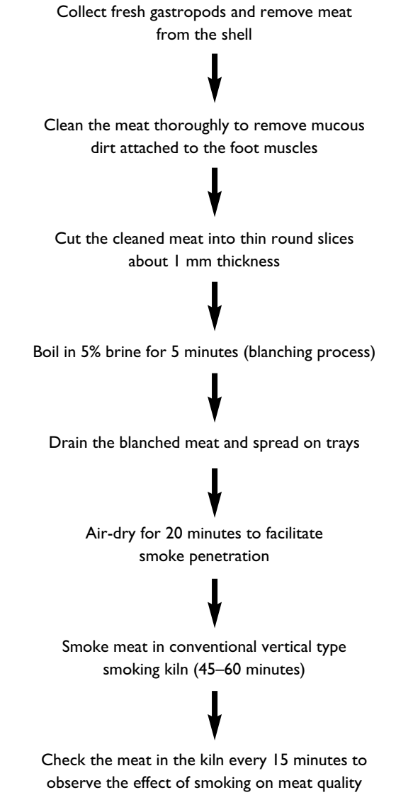
Figure 5. Smoking process