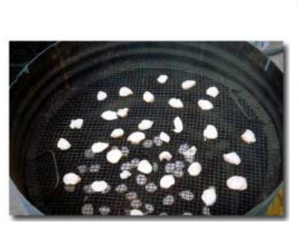
Figure 3. Freshly salted and dried meat ready for smoking