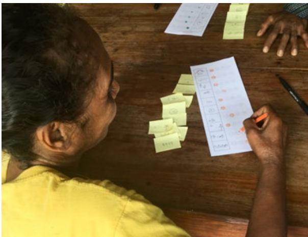
A participant in one of the focus group activities

We set out to understand the well-being values of gleaning for women and how those values differ seasonally. Understanding how seasons affect the ways people interact with and benefit from coastal ecosystems is particularly important in the context of a changing climate and shifting seasonal conditions (Oppenheimer et al. 2019). Although the contribution of gleaning to livelihoods in the context of seasonal availability and accessibility of other coastal fisheries has been recognised (Tilley et al. 2021), previous empirical work has not examined seasonal changes in the social well-being values of gleaning.