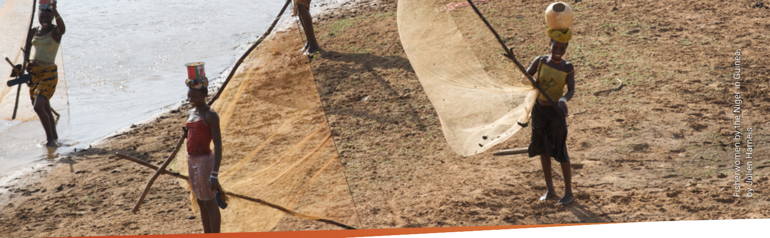
Fisherwomen by the Niger in Guinea.