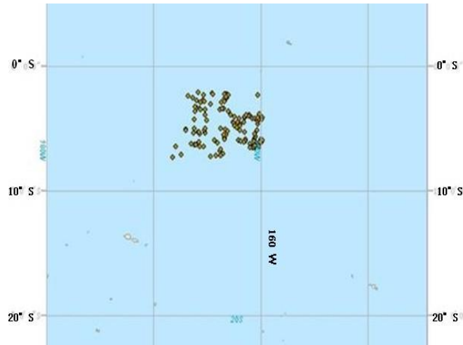
Figure 1 Survey areas by one Chinese observer during June to December 2009