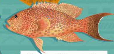
Variola albimarginata White-edged lyretail