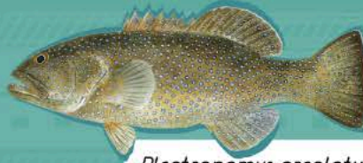
Plectropomus areolatus Squaretail coral grouper