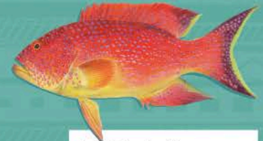
Variola louti Yellow-edged lyretail