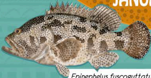
Epinephelus fuscoguttatus Brown-marbled grouper