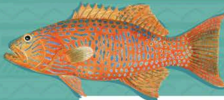
Plectropomus oligacanthus Highfin coral grouper