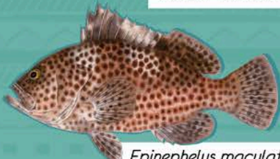
Epinephelus maculatus Highfin grouper