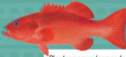
Plectropomus leopardus Leopard coral grouper