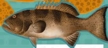
Plectropomus laevis Saddle grouper