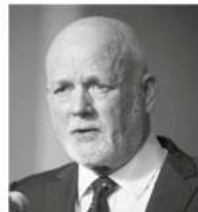
Peter Thomson UN Special Envoy for the Ocean

“Ocean science, supported by capacity development, is essential not only to inform SDG 14 but also other SDGs that have an ocean dimension”