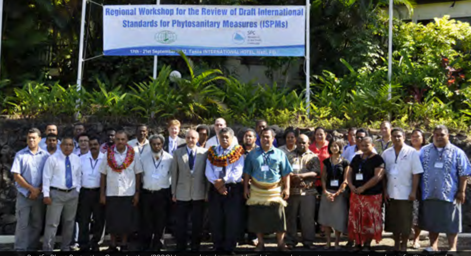
Pacific Plant Protection Organisation (PPPO) is mandated to provide advice on phytosanitary measures in order to facilitate trade without jeopardizing the plant health status of the importing members and countries. PPPO is one of the Regional Plant Protection Organisation recognised by the International Plant Protection Convention.

PICTs, such as plant pathologists, entomologists, veterinarians, soil scientists) need to be maintained for the long term.