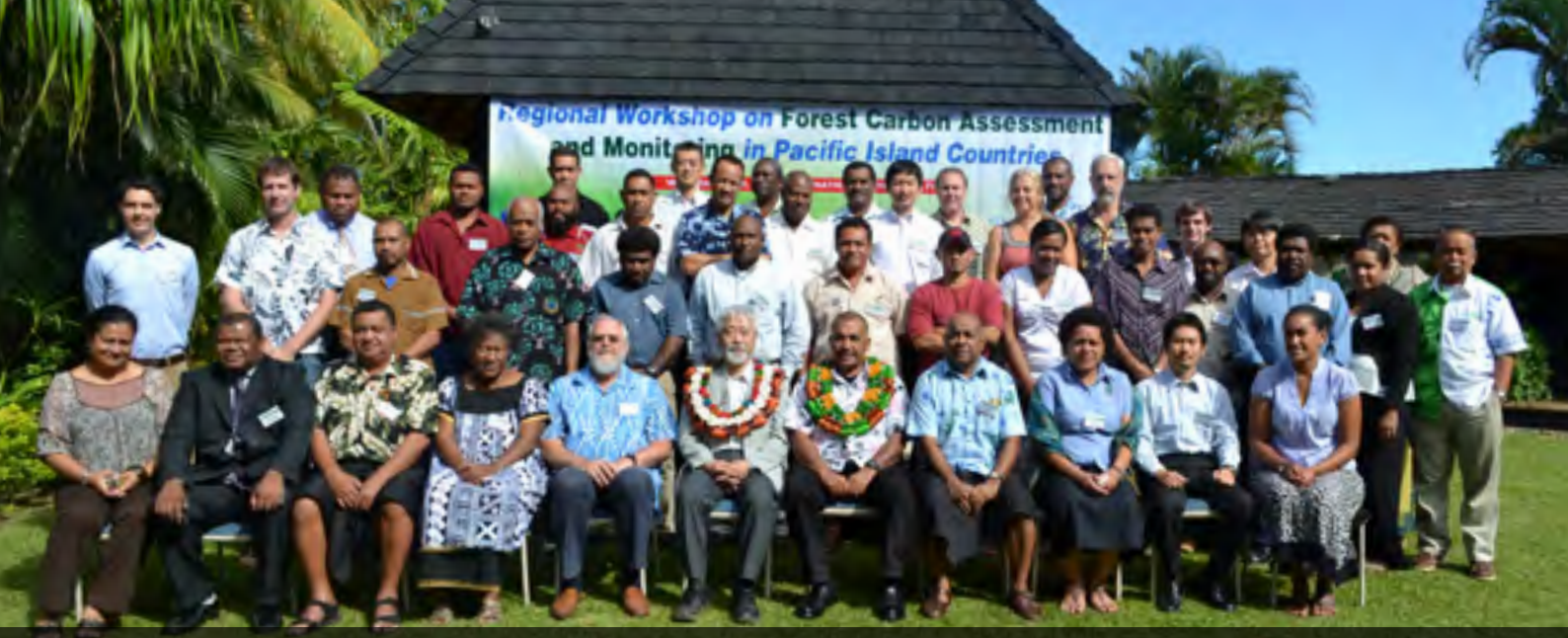
Delegates at the opening of the Regional Workshop on Forest Carbon Assessment and Monitoring for Pacific Island Countries. Sustainable forest management (SFM) describes a type of management that 'aims to ensure that the goods and services derived from the forest meet present-day needs, while at the same time securing their continued availability and contribution to long-term development'.