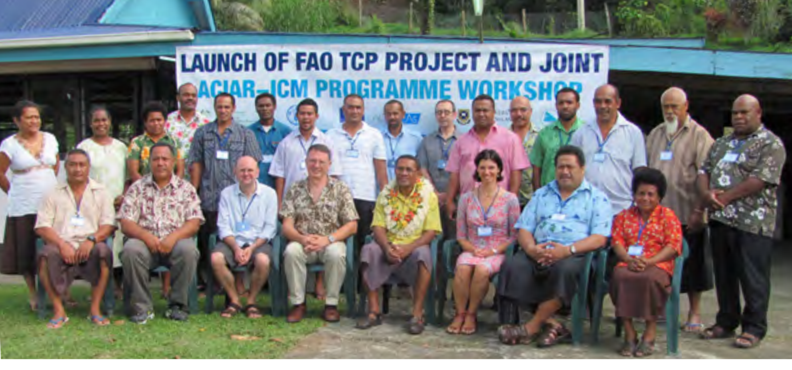
Inception Workshop for promotion of techniques to reduce hazardous pesticide use and to strengthen Integrated Pest Management in Pacific agriculture, a collaborative effort of FAO and ACIAR and research partners SPC and AVRDC.

Australian Agency for International Development (AusAID) International Climate Change Adaptation Initiative (ICCAI) and the US government, comprises crops and varieties that are tolerant to climate variability such as drought, salt and water logging. Eighteen PICTs (American Samoa, Cook Islands, Fiji, FSM, Guam, Kiribati, Nauru, New Caledonia, Norfolk Islands, Palau, Pitcairn Islands, Samoa, Solomon Islands, Tokelau, Tonga, Tuvalu, Vanuatu and Wallis and Futuna) have received crop accessions (banana, cassava, swamp taro, sweet potato, taro and yam) from the 'climate-ready' collection.