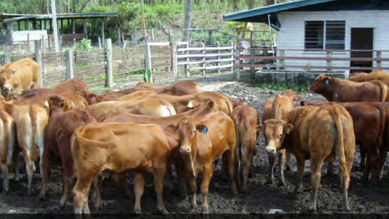
The Food Animal Biosecurity Network (FABN) project, currently implemented by the LRD Animal Health and Production Team and the School of Biomedical and Veterinary Sciences at James Cook University in Australia, aims to improve field and laboratory capability for animal disease surveillance in Fiji, Papua New Guinea (PNG), Vanuatu and Solomon Islands. Such an improvement will allow assessment under World Organisation for Animal Health (OIE) guidelines for trade in animals and animal products.

and mealy bug infestations and sooty mould spread on coconut, breadfruit and banana on some islands of the Marshall Islands.