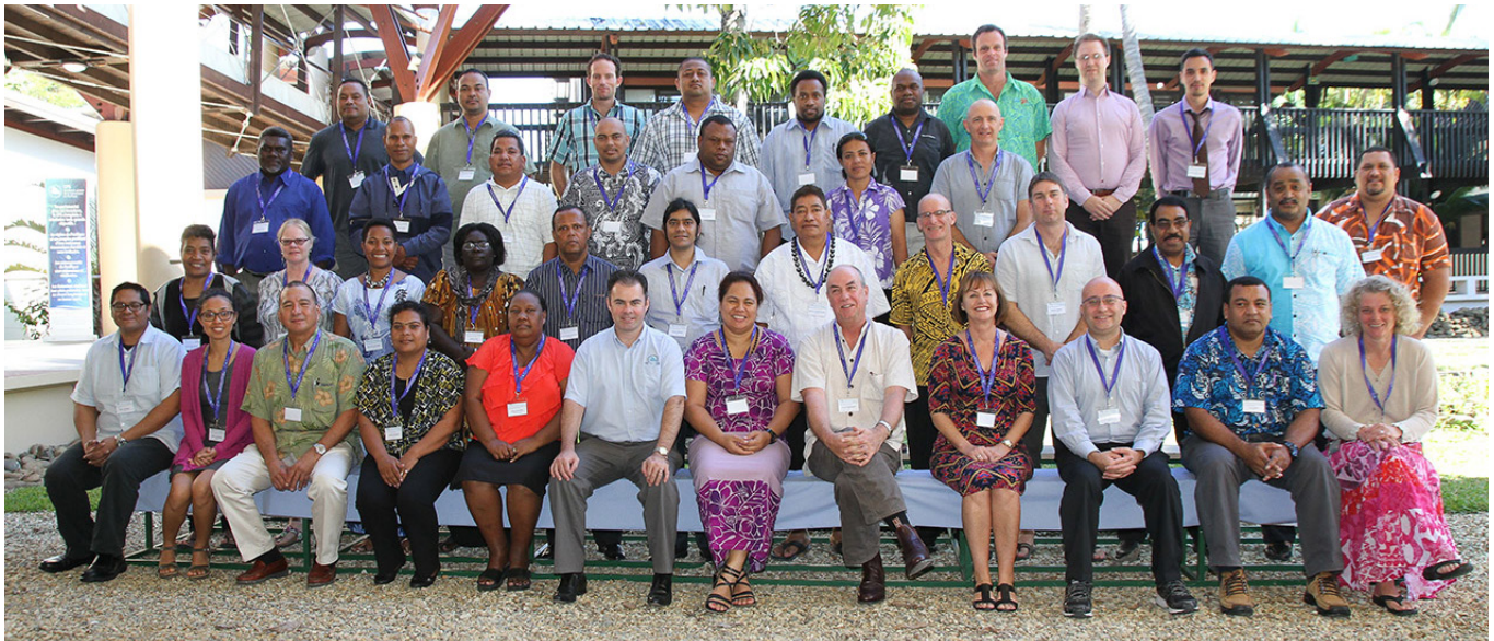
2020 Census Planning Meeting participants

disabilities were considered as core in this round of censuses. Many of these topics were recommended by the United Nations Statistical Commission, and by other specialised organisations. For example, detailed labour force questions were recommended by the International Labour Organization (ILO), while core questions on disability were recommended by the Washington Group.