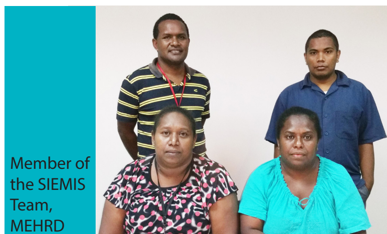
Member of the SIEMIS Team, MEHRD

PAR is the process of compiling and documenting factors that quantify MEHRD profitability, efficiency and adherence to budget, comparing actual results against original targets. The PAR process is usually conducted once per year; although in some cases it is carried out more often.