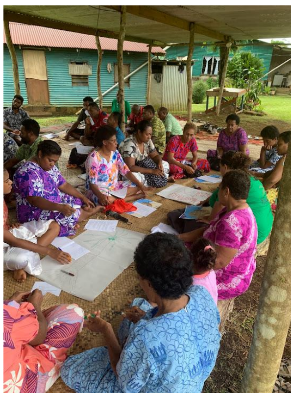
Figure 4: Women's focus group discussion.