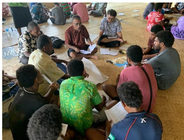
Figure 3: Men's focus group discussion.

All sessions were audio recorded, with data also captured on butcher's paper. Thematic analysis was used to identify key themes raised by participants which give insight into aspirations for being involved in the proposed value chain for women and men of different ages, and associated implications, including potential benefits and challenges they may experience.