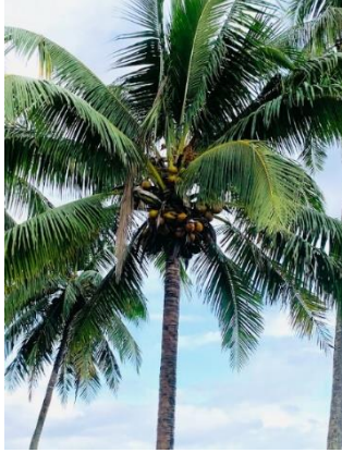
Figure 6: Coconut tree in Fiji.

When asked what the most important uses are, many participants stated food and as a source of income. Participants explained how coconuts, particularly coconut cream, are a key part of their daily diet and are a key ingredient in baked goods prepared for community gatherings and in traditional ceremonial meals. Coconuts were also described as an important source of food for animals, such as pigs which are raised for household consumption or to be sold for cash income.